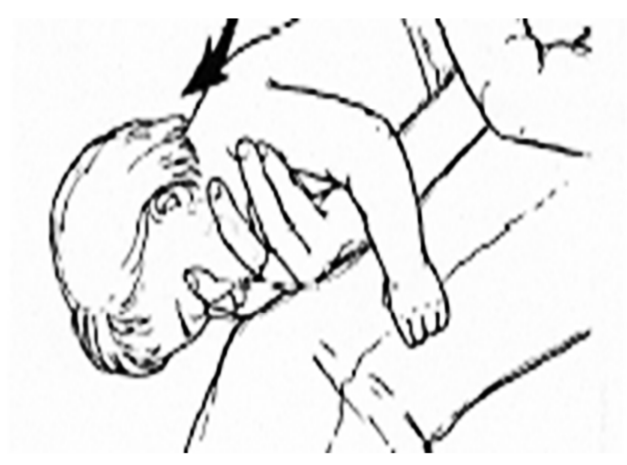
Beránková a kol., 2002