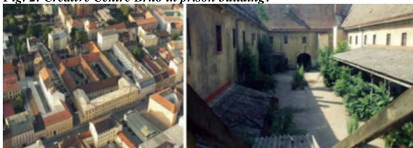
Fig. 2: Creative Centre Brno in prison building?

The initiator of the project is the Brno's municipal authority, a feasibility study by the South Moravian Innovation Centre, an association of legal entities established by the South Moravian Region, the Statutory City of Brno, Masaryk University, the University of Technology, Mendel University and the Veterinary and Pharmaceutical University in Brno. The South Moravian Innovation Centre (JIC) focuses on supporting innovative business and commercial exploitation of research and development (R&D) and facilitating the interconnection of universities and research institutions with the business sphere in order to maximize R&D at regional and national level (JIC, 2018a).