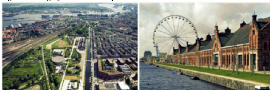
Fig. 3: Westergasfabriek cultural park