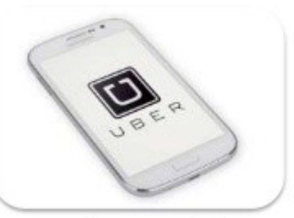
Regulator might be "behind the curve" with new technologies