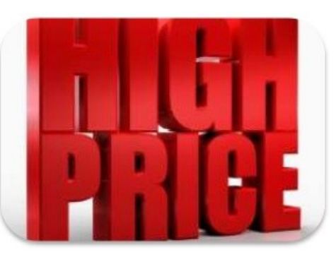
Charging excessively high prices

minating tariffs/r dis-crimi-na-tion nating; ability to c show much ~ in t goods from fore