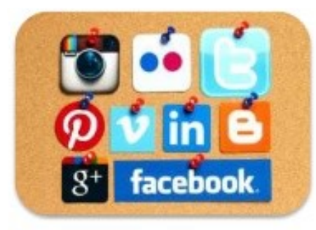
Regulators may limit innovation in fastgrowth markets