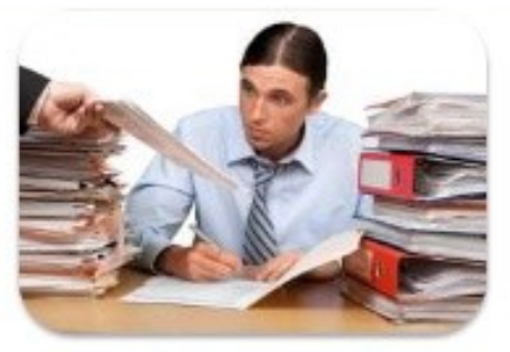
Regulation becomes bureaucratic & costly