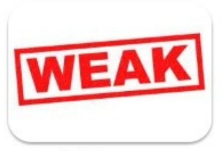
May lack the powers to be truly effective in protecting consumers