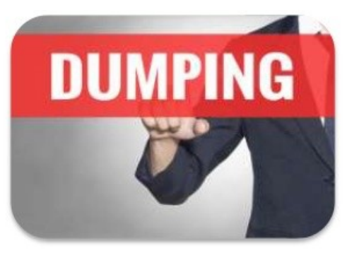
Predatory pricing and limit pricing