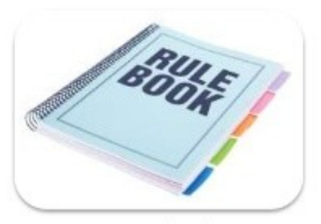
Frequent rule changes can stifle business investment