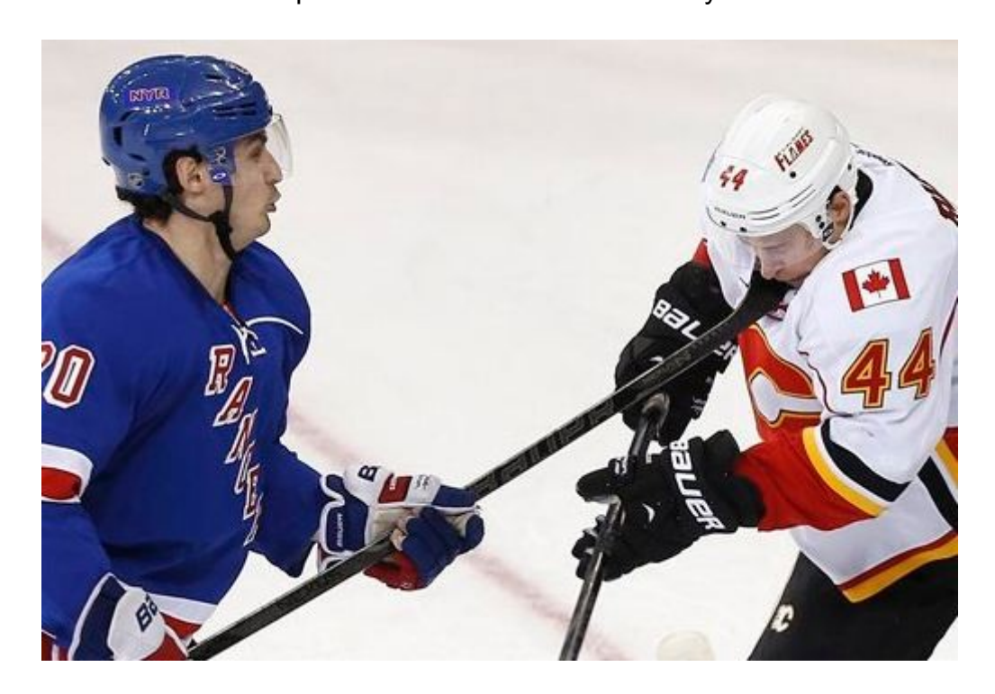
Task 3: Look at the pictures and decide which fouls you can see in them: