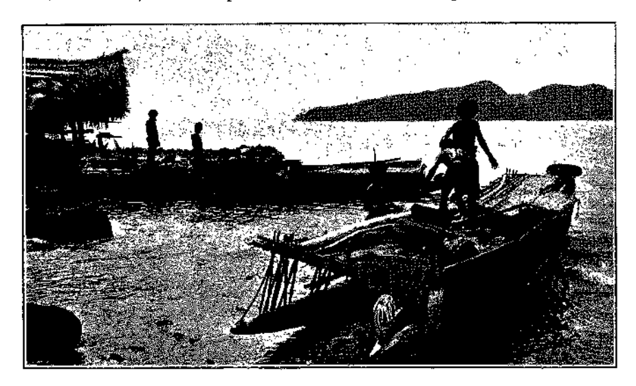
LOADING LARGE CLAYPOTS IN THE AMPHLETT ISLANDS, IN CONNECTION WITH THE KULL.

This does not exhaust the subtleties and distinctions of Kula gifts. If I, an inhabitant of Sinaketa, happen to be in possession of a pair of armshells more than usually good, the fame of it spreads. It must be noted that each one of the first-class armshells and necklaces has a personal name and a history of its own, and as they all circulate around the big ring of the Kula, they are all well known, and their appearance in a given district always creates a sensation. Now all my partners—whether from overseas or from within the district—compete for the favour of receiving this particular article of mine, and those who are specially keen try to obtain it by giving me pokala (offerings) and kaributu (solicitory gifts). The former (pokala) consists, as a rule, of pigs—especially fine bananas and yams or taro; the latter (kaributu) are of greater value: the valuable "ceremonial" axe blades (called beku) or lime-spoons of whale's bone are given. There are further