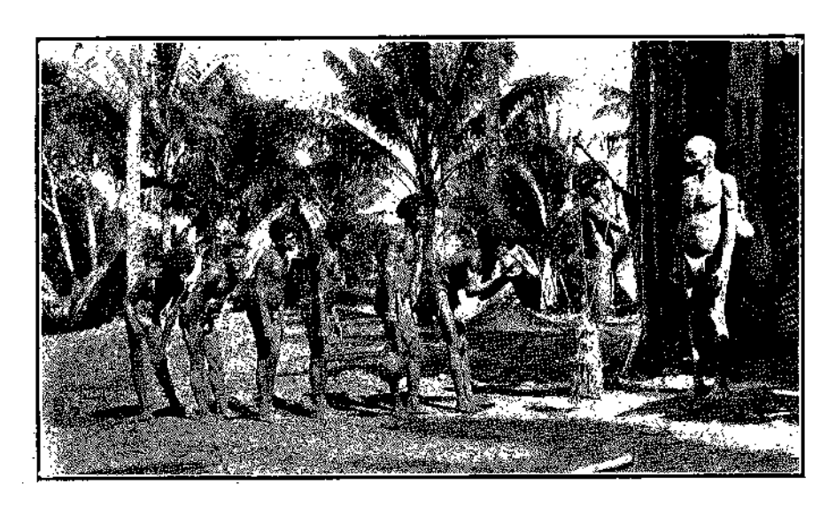
AN EPISODE IN THE INLAND KULA: OFFERING A NECKLACE (SOULAVA) TO A CHIEF.