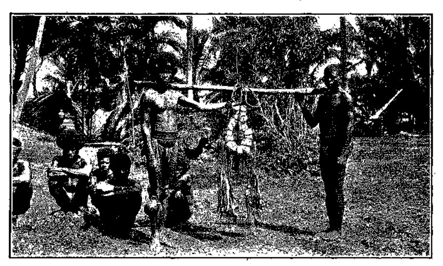
ARMSHELLS CEREMONIALLY BROUGHT INTO OMARAKANA VILLAGE FROM A SMALL EXPEDITION TO KITAVA,

The Kula has been called above "a form of trade." The usual a priori notion of savage trade would be that of an exchange of indispensable, or, at least, useful