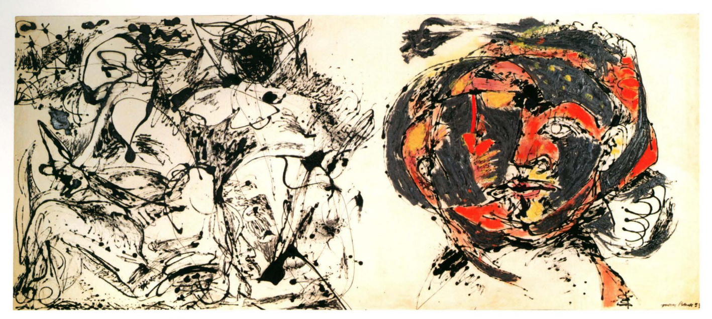
Jackson Pollock, Portrait and a Dream, 1953. Oil and enamel on canvas, 58½ x 134¾ inches (148.6 x 342.3 cm). Dallas Museum of Art, gift of Mr. and Mrs. Algur H. Meadows and the Meadows Foundation. Incorporated

of the painting as a whole. Each of his gestures epitomizes the subjectobject: they famously purport to harness unconscious impulse as the animating force of paint itself, thus fusing subject and object. On the macro scale, a field of such marks exists in a perpetual state of coming into form and collapsing out of it: here the subjectobject aporia is rooted in the viewer's incapacity to make the work cohere as a picture. Indeed, at both scales, Pollock's elaboration of passage seems to exemplify Twombly's description of line as "the event of its own materialization." In short, Pollock's drip paintings, in their dynamic economy of passage, seem to be the antitheses of pictures, which are characterized by frozenness, or reification. Yet Greenberg famously fretted that Pollock's allover drip paintings come "closest of all to decoration-to wallpaper patterns capable of being extended indefinitely and in so far as it still remains easel painting it infects the whole notion of this form with ambiguity."13 Wallpaper is an extreme example of a commodified, mass-produced picture. As Greenberg's anxiety makes clear, Pollock's allover paintings were always haunted by a return of the repressed: the eruption of one semiotic system—that of the picture—within another, the supposedly liberated "relation of dynamic forces" among Pollock's dripped and flung skeins of line.