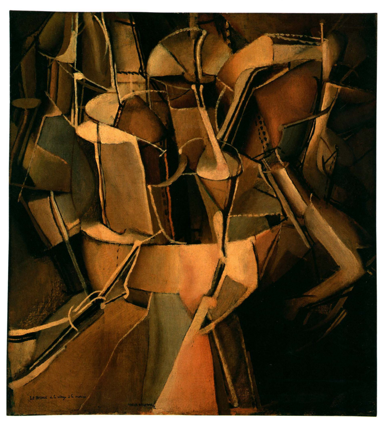
Marcel Duchamp, Le Passage de la vierge à la mariée (The Passage from Virgin to Bride), 1912. Oil on canvas, 23% x 21½ inches (59.4 x 54 cm). The Museum of Modern Art, New York. Purchase