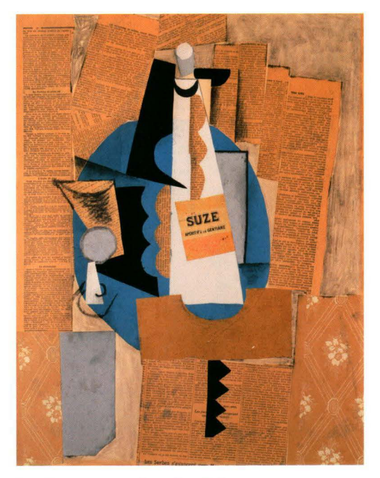
Pablo Picasso, La bouteille de Suze ( Bottle of Suze ), 1912. Pasted papers, gouache, and charcoal, 25% x 19% inches (65.4 x 50.16 cm). Mildred Lane Kemper Art Museum, Washington University in St. Louis, University purchase, Kende Sale Fund, 1946

triptych Pure Red Color, Pure Yellow Color, Pure Blue Color (1921), each canvas carries nothing but one of the three primary colors. Here artistic labor is conceptual: it defines painting as a set of conventions, or a discursive field, that the artist must visualize.