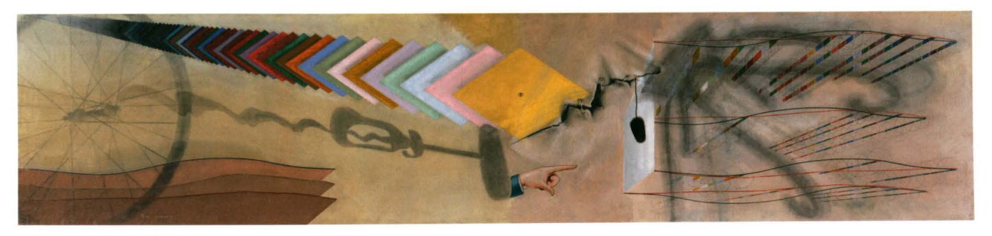
Marcel Duchamp, Tu m* , 1918. Oil on canvas, with bottle brush, safety pins, and bolt, 27% x 119% inches (69.8 x 303 cm). Yale University Art Gallery, New Haven. Gift of the Estate of Katherine S. Dreier.

Duchamp's remarkable pictorialization of the readymade in his valedictory painting, Tu\ m' (1918), whose integration of appropriated objects into the field of the canvas was later profitably taken up by Robert Rauschenberg and, even more systematically, by Jasper Johns, not to mention a host of figures in Europe ranging from Yves Klein to Arman. In other words, if the initial deployment of the readymade suggested that the generic object of art had superseded the specific medium of painting, Duchamp completed a circuit by returning the readymade to painting: in Tu\ m' an actual bottle brush, a ready-made brushstroke, points out directly at the viewer,