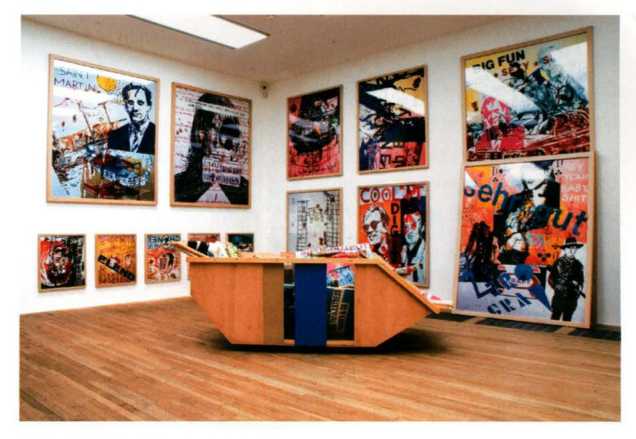
Martin Kippenberger, Heavy Burschi (Heavy Guy) , 1989/1990. Installation view, "Martin Kippenberger," Tate Modern, London, 2006

This mode of fictionalization was a fundamental means for the Cologne artists to deflect attention from the production of marketable objects, while retaining control over what Palazzoli called, with regard to A.I.R., the community's "intellectual capital and its creative games," through the semiprivate codes of the in-joke. Kippenberger's Heavy Burschi ( Heavy Guy ) of 1989/1990