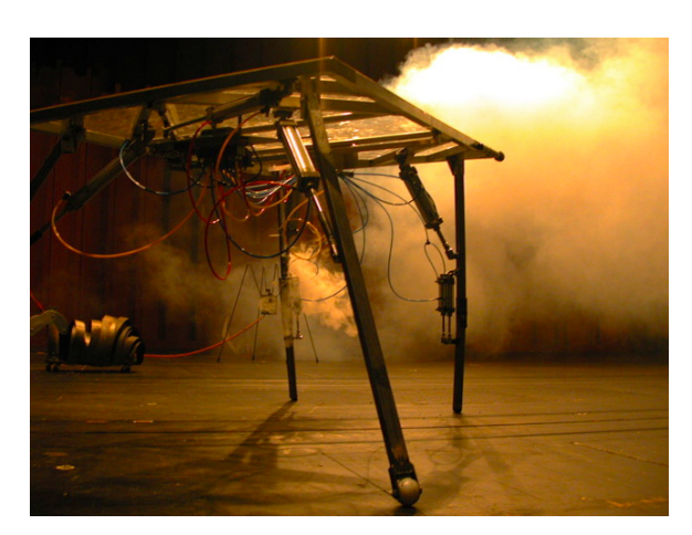
Fig. 7 A Walking Table (Shockheaded Peter 2000).

To explore the acceptance of artificial behaviors, theatre can provide fictitious environments to stimulate a suspension of disbelief . Stage performers share similarities with the social robots and the puppets in that they both utilize gesture , body and physical action to incarnate behaviors. Even without an anthropomorphic body, the sign-action of the performing objects can nevertheless find foundations in human acting methods to trigger empathic responses in the audience.