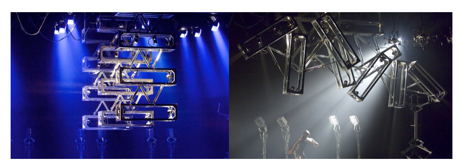
Fig. 6 Organic cubes (Devolution 2006). Left: Neutral Position. Right: Unfolded and floating.

Staging this object in a cage results on the viewers' anthropomorphisation of its nature by means of an interpretation of the whole situation as a captive untamed and miserable entity in La Cour des Miracles [10,11,12]. The interpreted behavior emanates out of the juxtaposition of this social mise-en-scène and the inherent "out of control" motion of a complex dynamic and chaotic system in action.