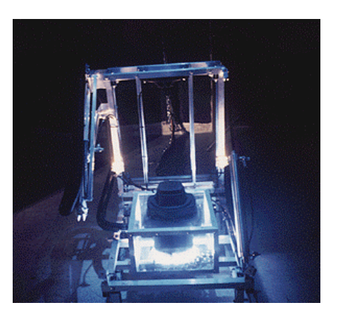
Fig. 8 A begging machine - La Cour des Miracles (1998)

Acting methods also propose that opposite stances as presence or absence can be taken by actors even during single performance: The presence calls upon the performer's experience to dwell on his/her experience to deliver the character (and refers rather to Performance art and quality of an authentic presence of theatrical production). The absence requires an abnegation of the self to produce a pure rendering of the directors' directives and scripts (and refers in its ultimate form to stage production as a re-presentation or sign system, a formal physical rendering of play-writer's text or director's ideas).