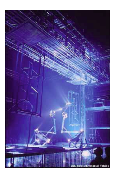
Fig. 1. Robot characters from Le Procès (1999).

This paper will focus on an understanding of robotic performances and robots as performers from the audience perspective by questioning the human ability and need to identify, empathize and project him/herself into performers, either objects or humans, on the stage.