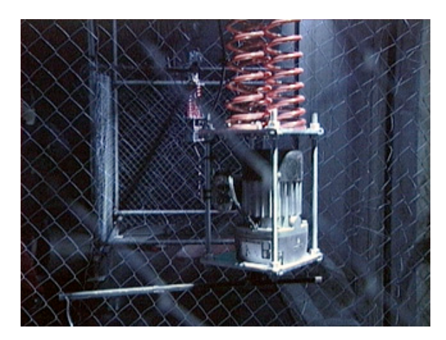
Fig. 5 Untamed machine (La Cour des Miracles 1998)

For example, in Figure 5 the Untamed Machine is a simple motor mounted on spring coils and this assemblage creates a rich range of chaotic and unpredictable movements. Aligned with the anti-mimetic shift reported in the recent robotic art and also with the swindle of the Chess player [36], the behavior is delivered without an immense degree of computation (as in bottom-up AI [31, 5]).