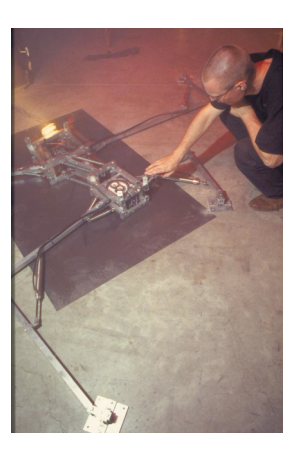
Fig. 9 A machine under convulsion – La Cour des Miracles (1998)

The Beggar of Figure 8 had neither experience of misery nor of being pitiable. Its shape was a square box (symbol of a chest) that could rock over a hinge connoting the body language of imploring. The beggar performer is rooted towards absence while the table is ingrained in presence via the physicality of its gait.