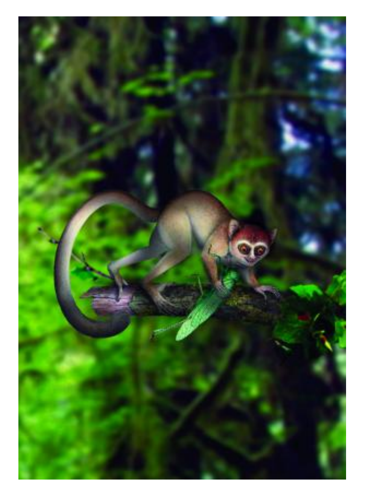
This is an artist impression of Archicebus achilles in its natural habitat of trees. Credit: Credit CAS/Xijun Ni.

The fossil has been named, Archicebus achilles.