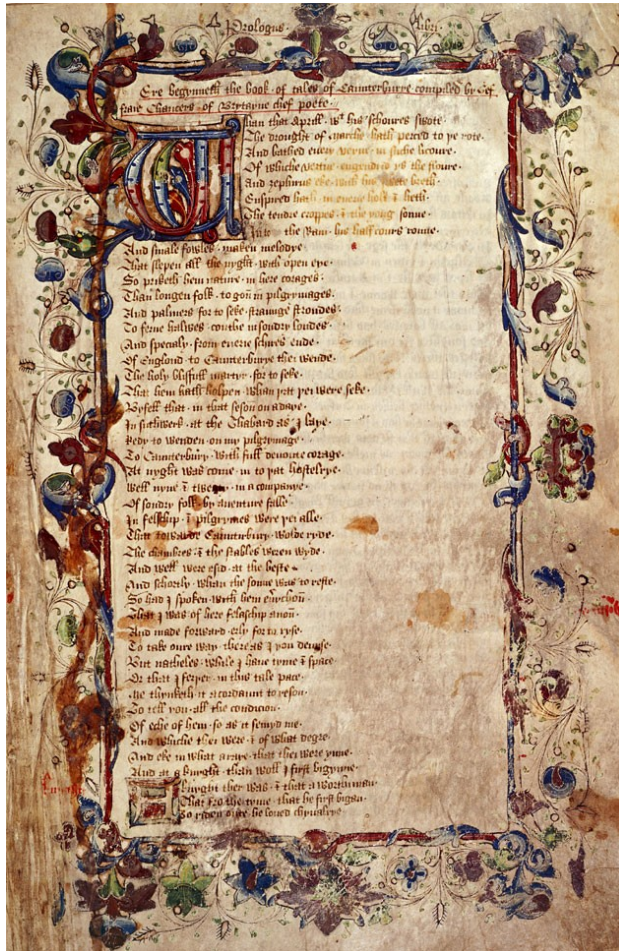
Beginning of the Prologue to the Canterbury Tales , c.1450-1460