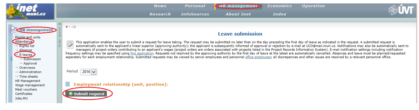
Figure 4: Preview of vacation request in the INET Information System.

More information on vacations can be found in the Employee Benefits