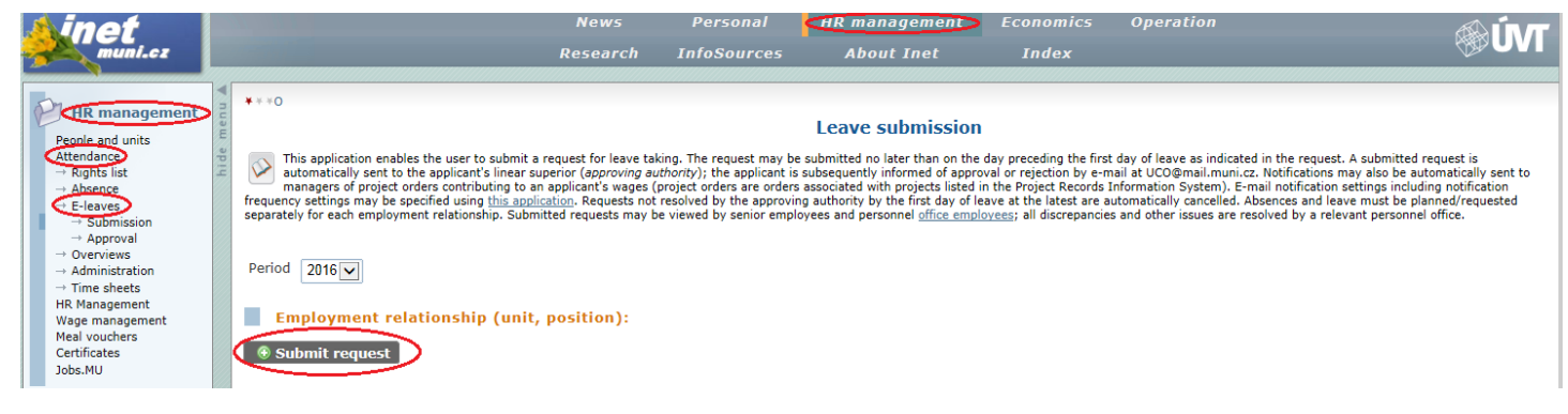
Figure 4: Preview of vacation request in the INET Information System.

More information on vacations can be found in the Employee Benefits