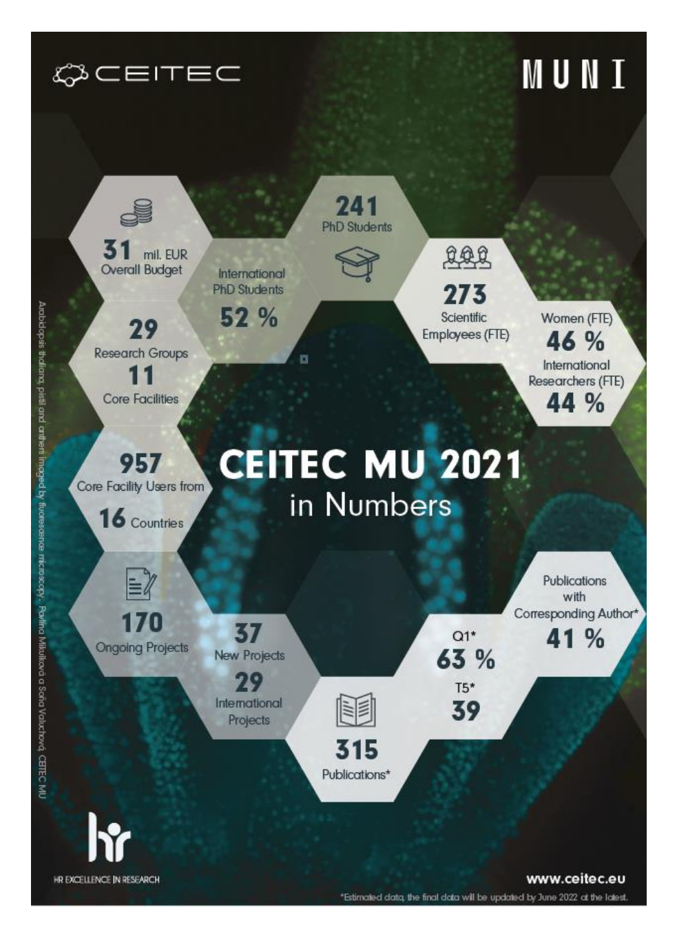
Figure 3: CEITEC MU in Numbers (2020)

As of 2020 data, there is a total of 412 employees (FTE) at CEITEC MU. 80% of them are researchers, technical workers currently working in 29 research groups. Of the total number of employees, 20% is represented by administrative staff. The Institute manages approximately CZK 778 million per year, which consists mostly of realised grants. Twice a year, the institute management issues detailed statistics from different fields such as HR, scientific performance, grants, PhD School etc. These statistics can be found on the document server in the <u>Reporting and Indicators</u> folder.