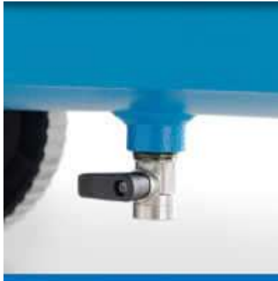
Figure 3 – Model drain valve of a piston compressor