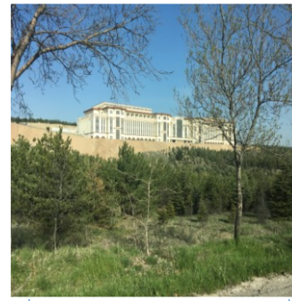
Hacettepe University building