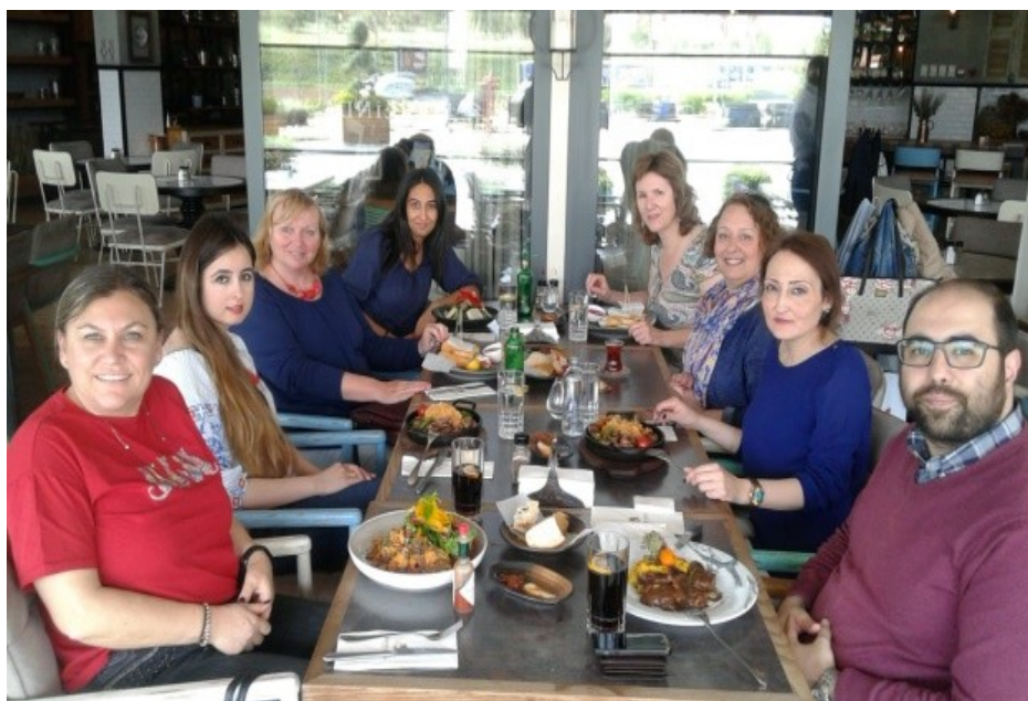
Members of teaching and curriculum development team