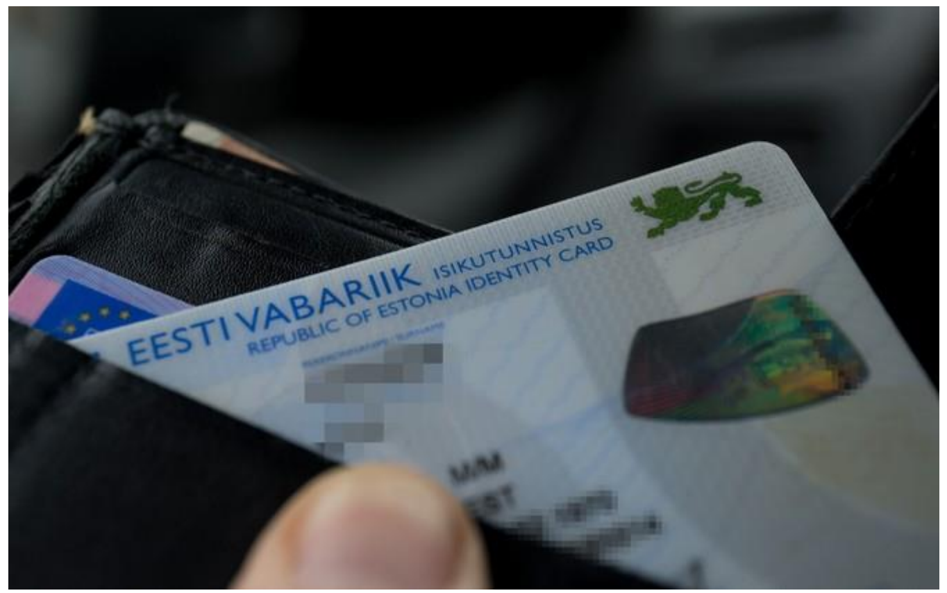
Estonian ID cards are used for online voting and digitally signing documents, among other things.

Last Thursday, Estonia's Information System Authority (RIA) was informed by an international group of researchers that a potential security risk had been detected affecting all national ID cards issued in Estonia after October 2014.