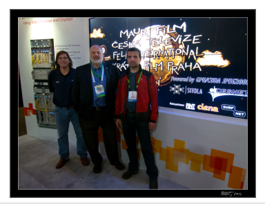
\mbox{VR}\, \bullet \,\mbox{AV} Technologies and Collaborative tools at Masaryk University \, \bullet \, April 15, 2015