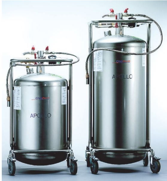
Figure 4 - Large containers for cryogenic liquids