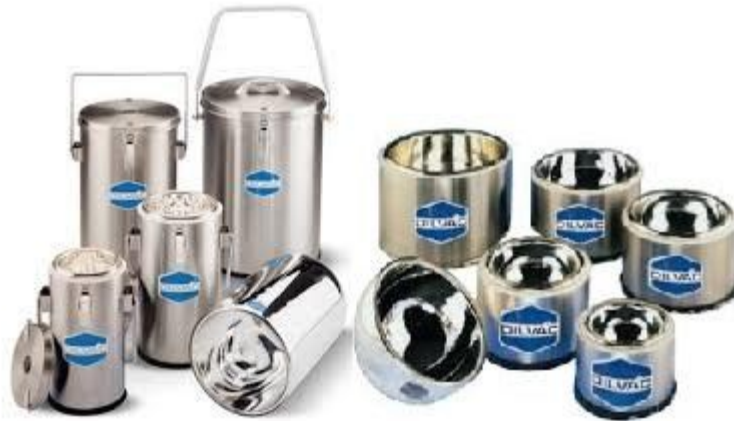
Figure 2 - Small vessels for cryogenics

unlikely to implode without impact or damage to the glass. When they do shatter, however, the process is quite vigorous and fragments of glass can be ejected at high velocity from the top opening.