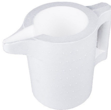
Figure 3 - Polystyrene foam container for liquid nitrogen handling

(6) A polystyrene foam container (with or without lid) can also be used for handling and short-term storage of liquid nitrogen, see Figure 3.