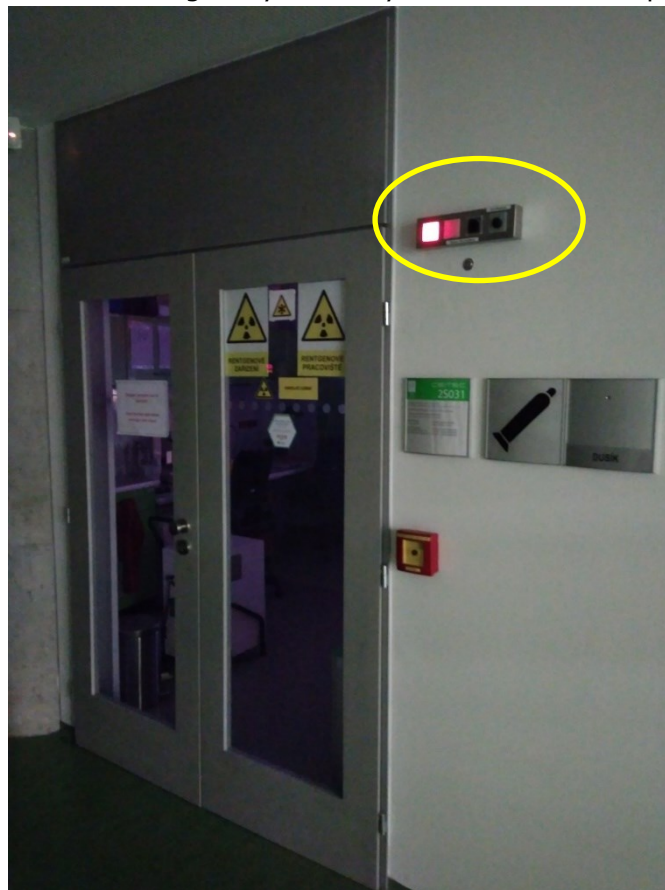
Figure 5 – Oxygen status signalling