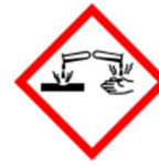
GHS05 – Corrosive