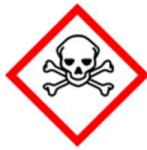
GHS06 – Acute toxicity