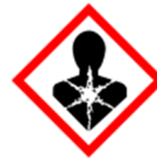
GHS08 – Serious health hazard