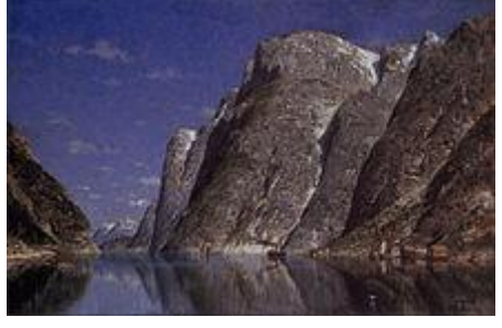
₽ «Dampskip» (Steamship)

Fiskevær i Nord-Norge» (1880) (Fishing Community in Northern Norway)