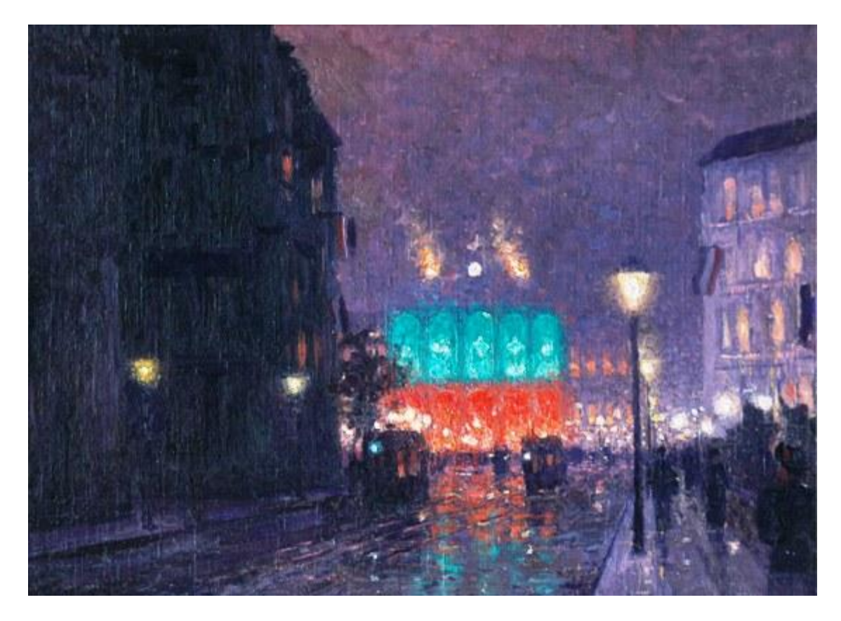
Berlin - Keiserens fødselsdag (Berlin the birthday of the Kaiser)