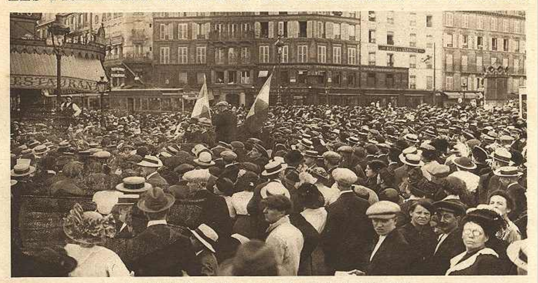
LA FOULE ÉMUE ET VIBRANTE ASSIÈGE LA GARE DE L'EST

Dimanche 2 août 1914... une date qui restera historique. Quarantequatre ans après la mobilisation fiévreuse qui devait aboutir à un désastre, nos hommes s'en sont allés, admirables de sang-froid et de confiance, vers la frontière. A la gare de l'Est, le spectacle