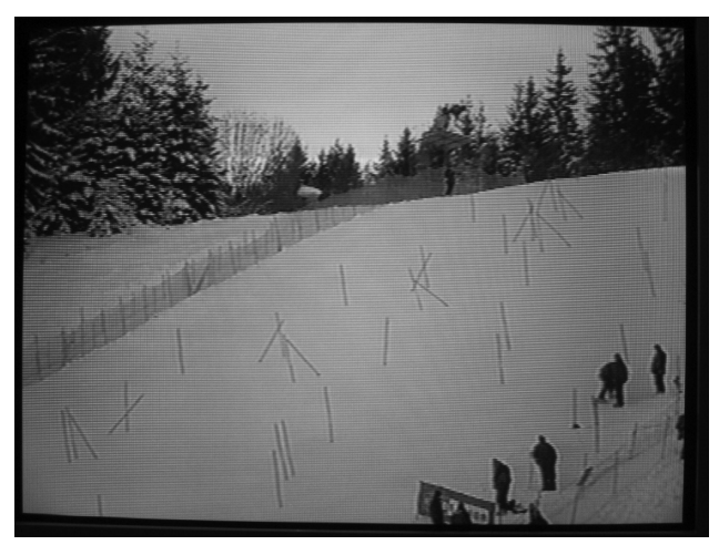
Examples of slalom ski polygon and surroundings, broadcast by TVS (Kranjska Gora, Slovenia)

are one in nature but they inter-mingle coherently only in the perspective employed on the site of the ski event. When watching the same event on TV, the correlation between the landscape and the polygon becomes considerably changed and reorganized in favor of ski polygon and to the detriment of that what is beyond. In spite of the fact, that the TV image of the space in many cases remains extensible, flexible, ubiquitous, and made for signaling its continuity with the winter landscape, it is also an indisputable fact that certain territorialization is the constituent element and the inevitable by-product of cultural transformation of sporting event.