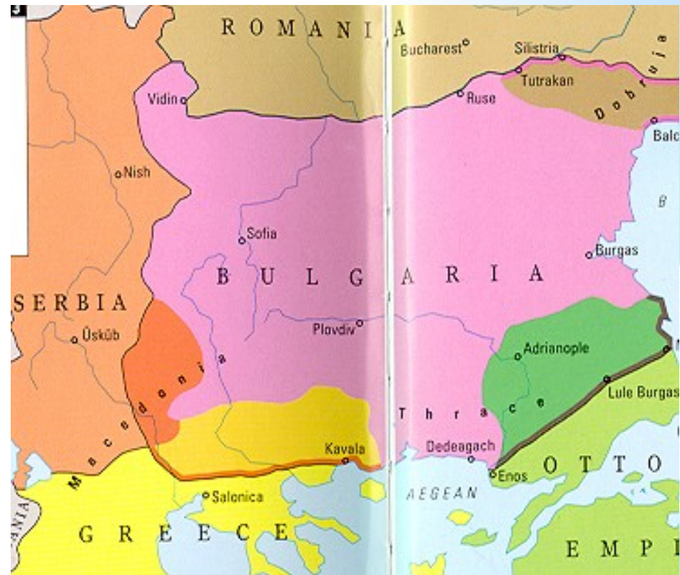
2nd Balkan War