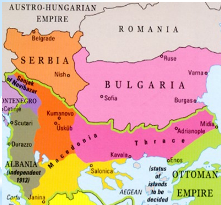
1st Balkan War