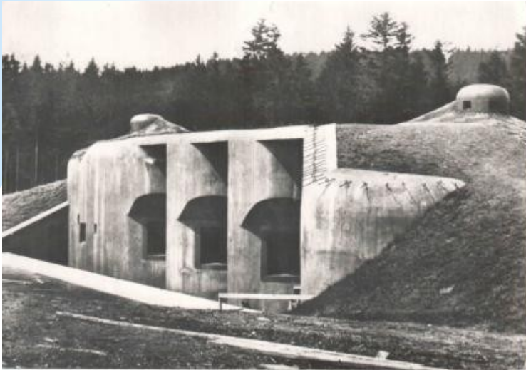
Czechoslovak border fortification – Hanička