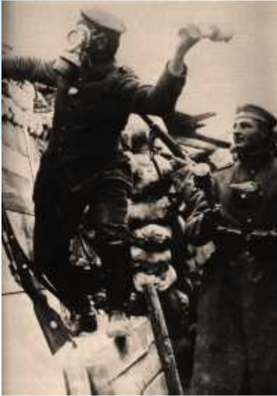
The Second Battle of Ypres