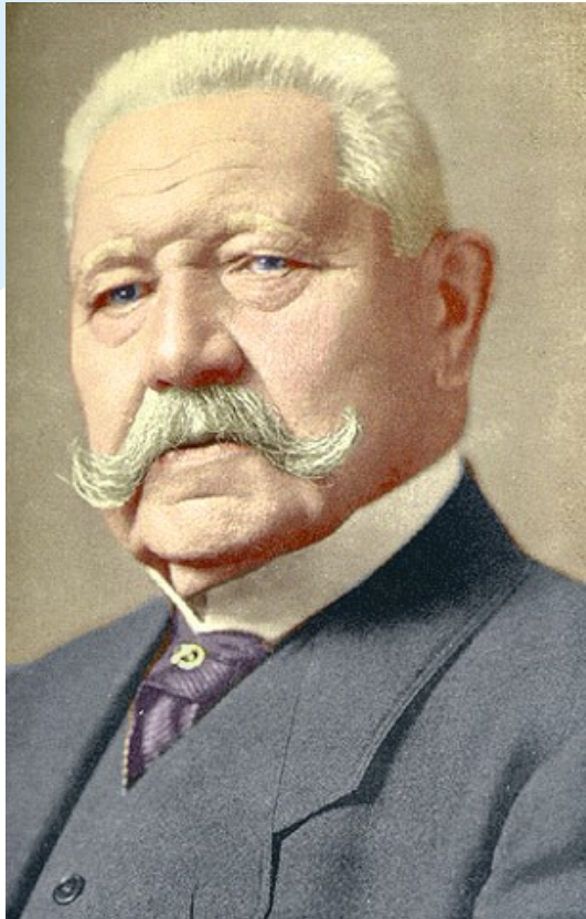
Paul von Hindenburg