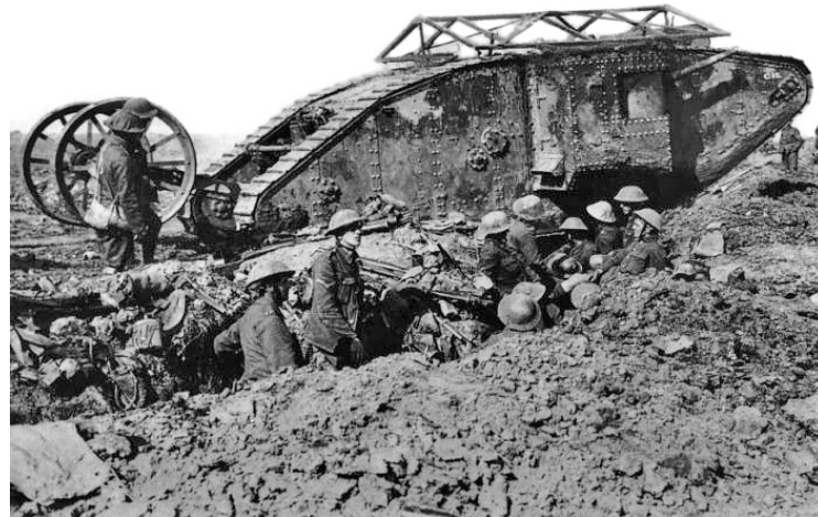
The Battle of the Somme