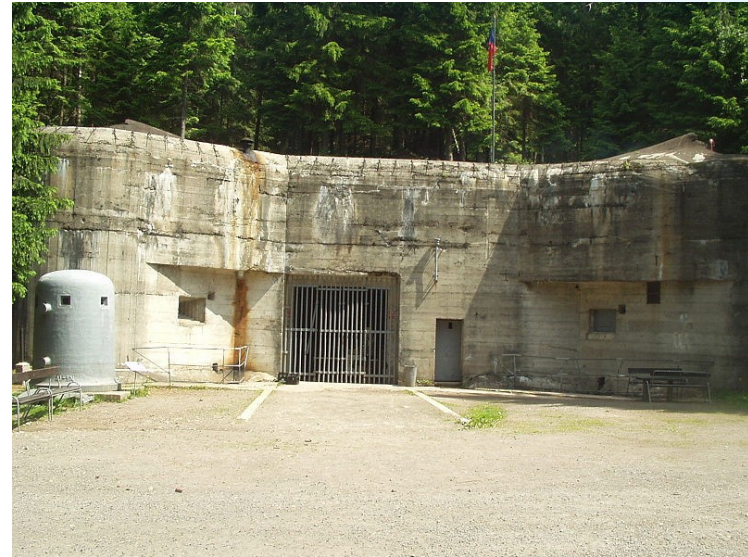
Czechoslovak border fortification – Bouda