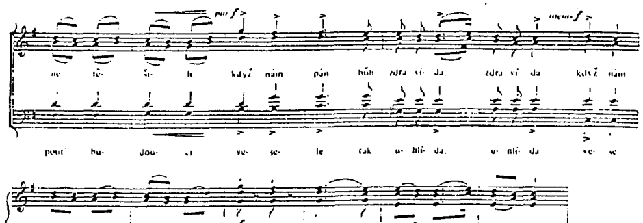
Example 8: Smetana, The Bartered Bride, act I, sc. 1.