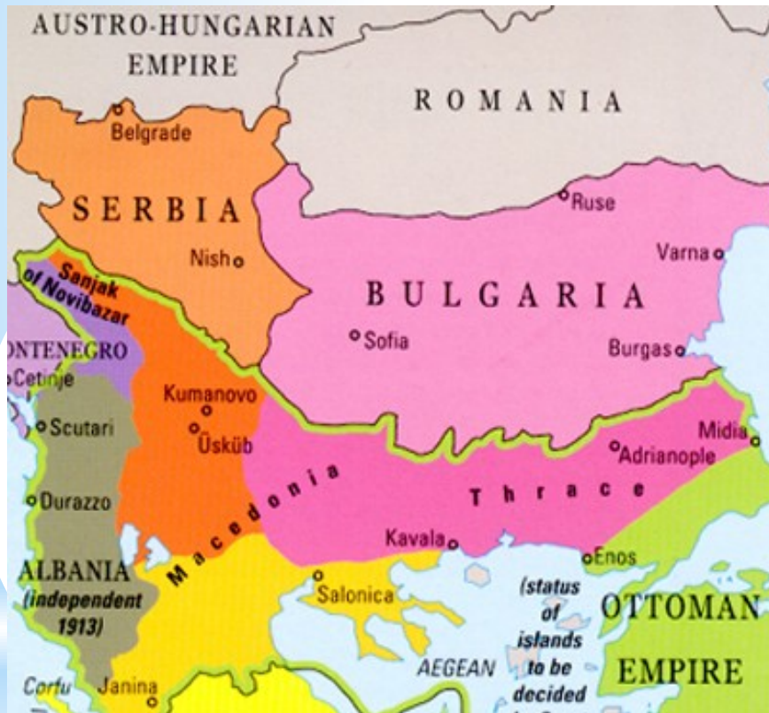
1st Balkan War