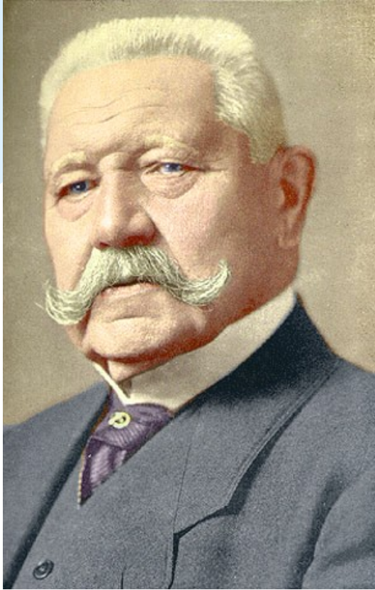
Paul von Hindenburg