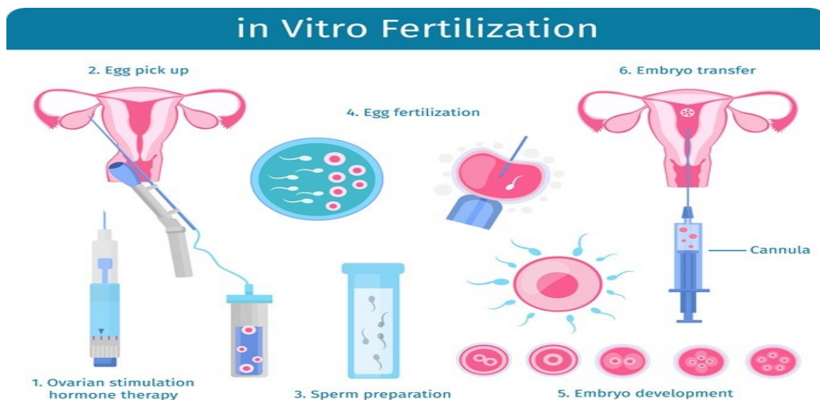
picture 1- IVF