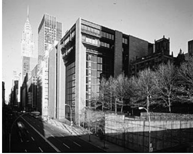
The Ford Foundation in New York City

Voluntary associations, like sport clubs