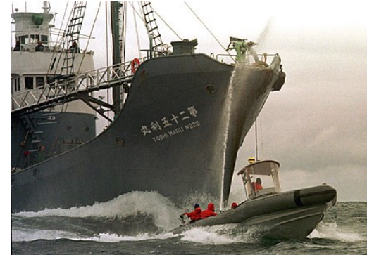
Greenpeace in Action...