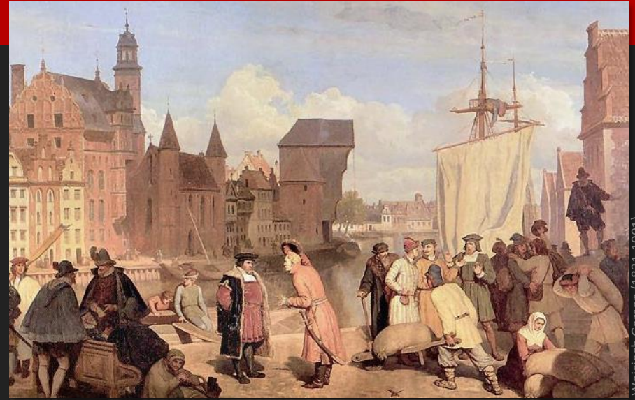
Wojciech Gerson (1831-1901)