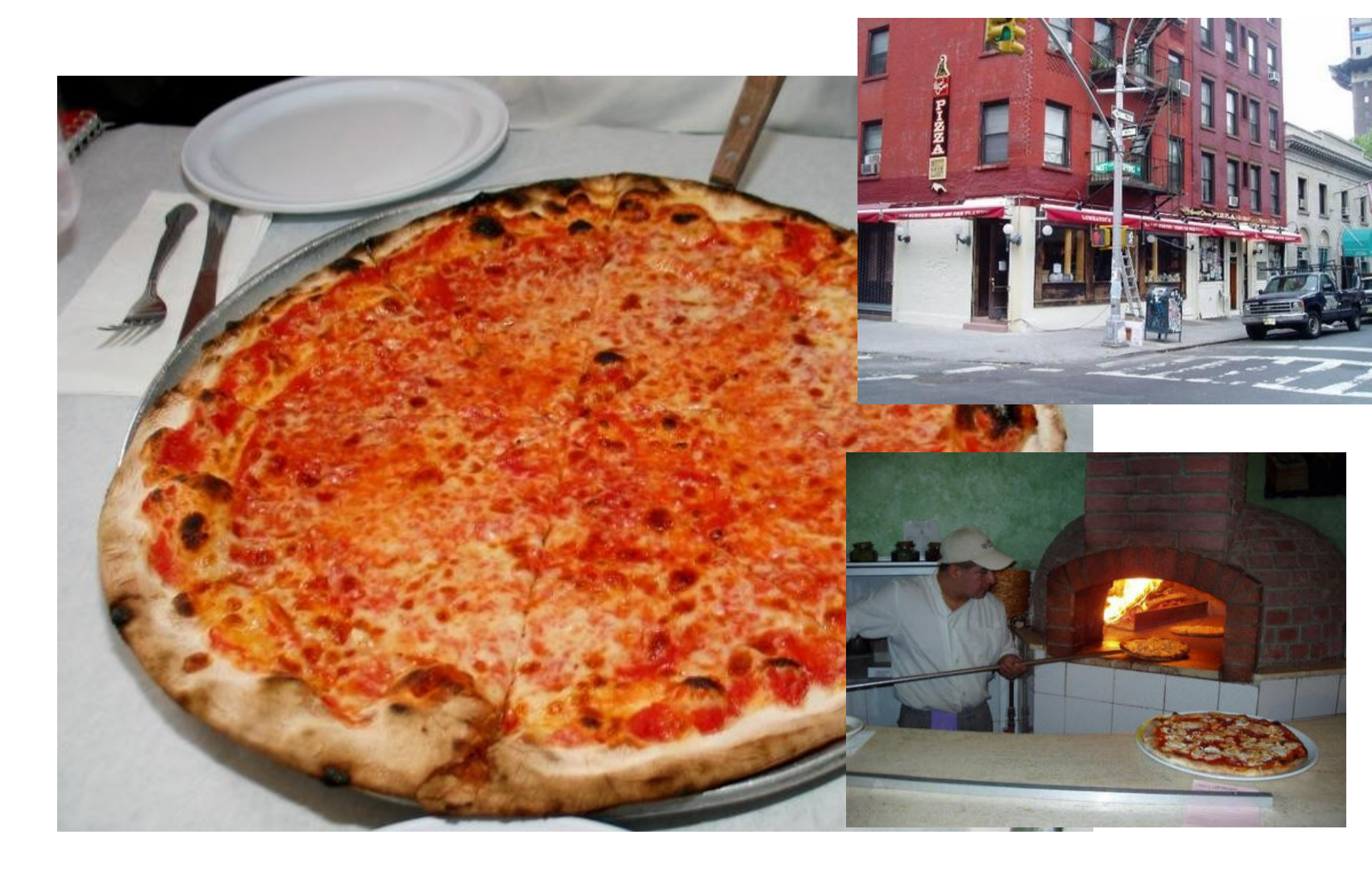
Lombardi's employee (Tonono Pero) and Coal Oven