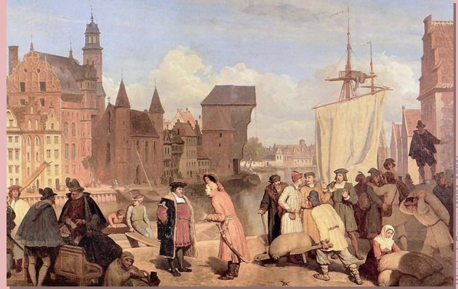
Wojciech Gerson (1831-1901)