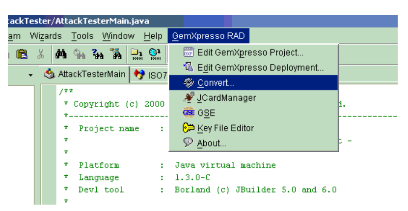
Pict. A-2: Conversion of compiled code for smart card.

The applet is compiled using Project->Make project and converted into a smart card compatible format. The conversion starts using the Convert command from the plug-in menu added by the GemXpresso RADIII into environment (viz. Pict. A-2 ). This menu can be also used for modification of settings of project, adding new types of card for conversion etc.