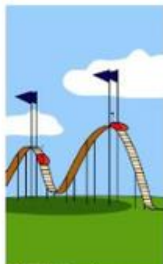
How the customer was billed