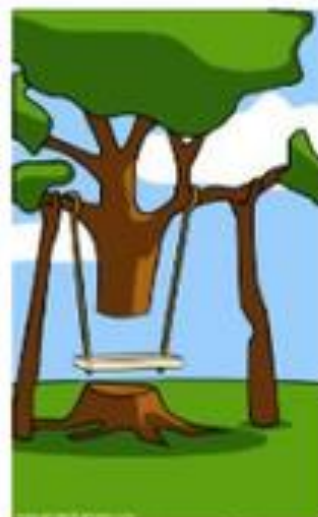
How the analyst designed it