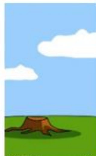
How it was supported