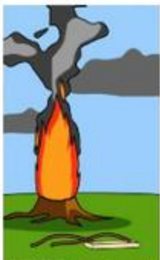
How it performed under load