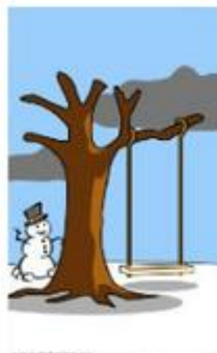
When it was delivered