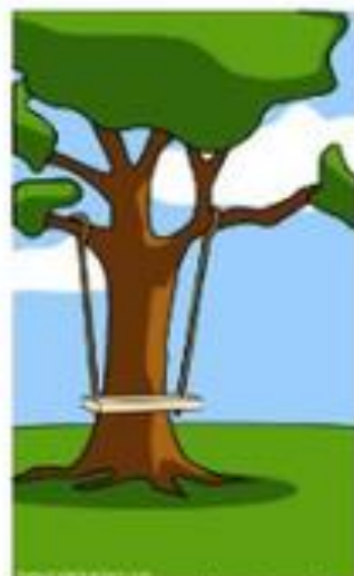
How the project leader understood it