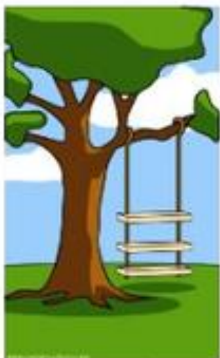
How the customer explained it

Create your own cartoon at www.projectcartoon.com