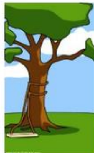
How the programmer wrote it