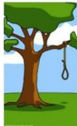
What the beta testers received