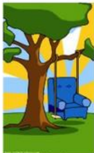
How the business consultant described it