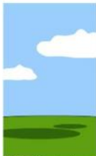
How the project was documented