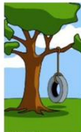
What the customer really wanted