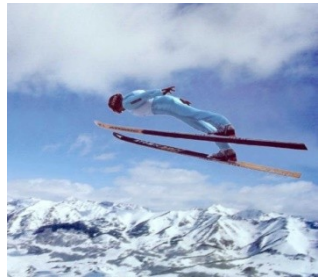
Sport, <del>male</del>, <del>water</del>, <del>sea</del>, <del>sky</del> Missing: cloud, ski, snow