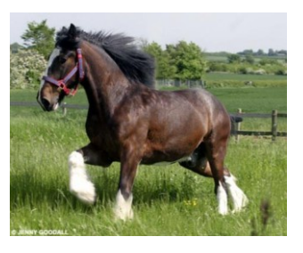
Horse, <del>person</del>, grass, daytime, plant Missing: countryside