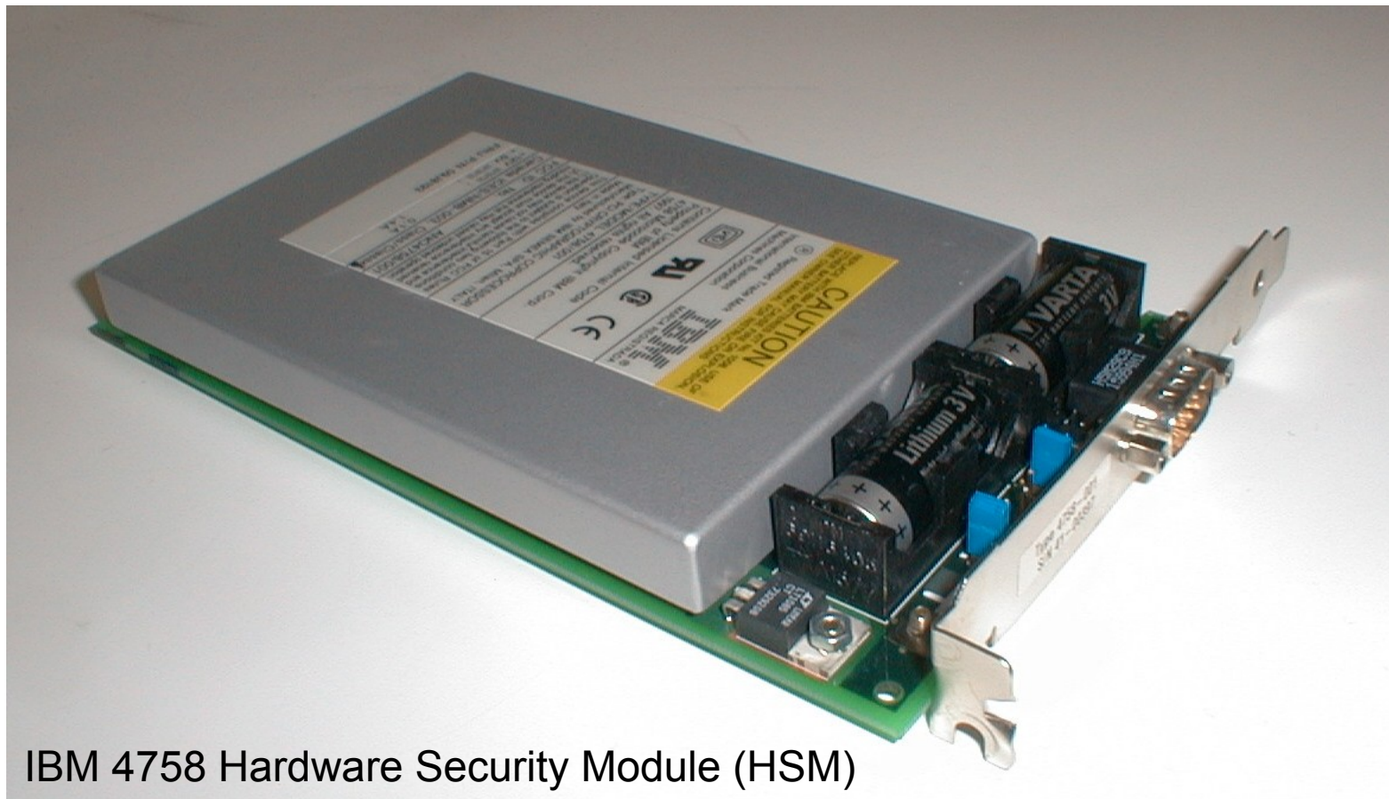
IBM 4758 Hardware Security Module (HSM)