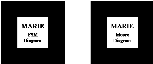
Figure 1: Examples of trained markers.

The architecture of the MARIE system prototype is presented in Figure 1. It consists of a lightweight Head Mounted Display (HMD), a small camera and a computer. The system uses some of the functionality of the ARToolkit , a free distributed software C library that was designed to easily develop Augmented Reality applications [16]. This toolkit makes use of computer vision techniques to effectively compute the real camera position and orientation relative to predefined marked cards.