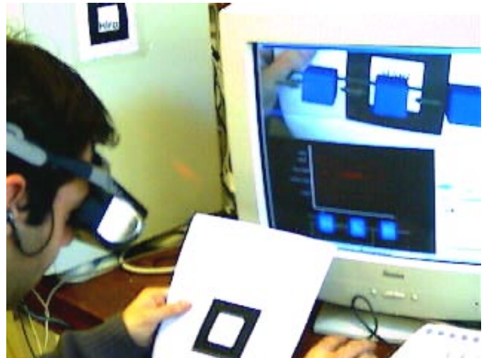
Figure 4: Monitor augmented reality view.

the marker in three-dimensional space to receive a different perception. They can also use the mouse to zoom, pan and rotate the rendered images and animations. They can also select to play the .wav file associated with the marker using a keyboard button. On the other hand, the teacher (who does not wear an HMD) can interact with the student using the mouse or the keyboard, again in the same way. One clear advantage of MARIE is that the teacher can speak to the student at the same time that the user listens to the .wav file and the system then mixes the two sound sources together.