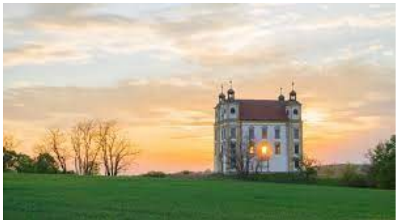
How to get there <a href="https://goo.gl/maps/DAUqrDpmcPJHnhxw8">https://goo.gl/maps/DAUqrDpmcPJHnhxw8</a>

Huge park for tours, historical city centre with church, one of the biggest jewish cemeteries + in Moravský Krumlov there is a castle with the view (Floriánek) and a castle in the city where there is a super famous Slavic Epopey – huge pictures from the Slavic history.