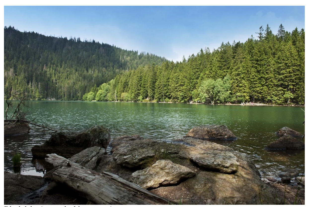
Black lake (guess the biggest one)