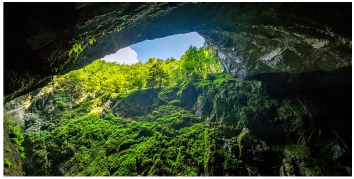
http://www.moravskykras.net/en/moravian-karst.html How to get there https://goo.gl/maps/poomZcrd4ViSReCW8

Macocha – deepest place in CZ Caves, views, forests