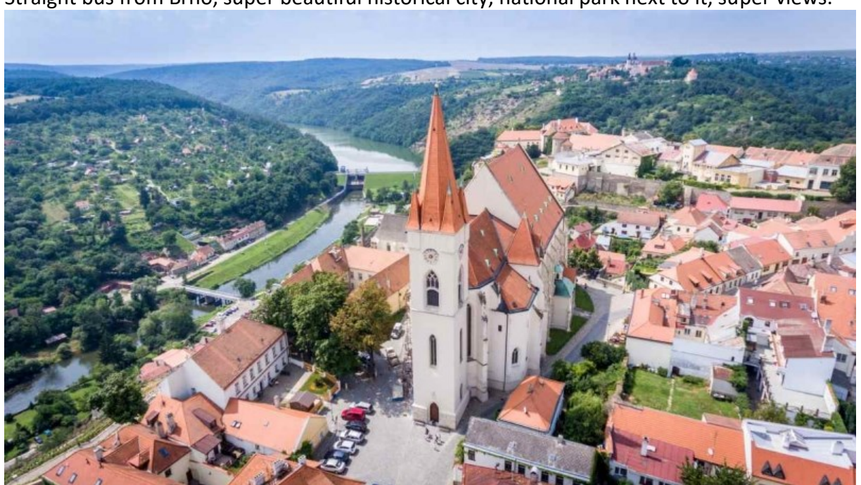
Znojmo Straight bus from Brno, super beautiful historical city, national park next to it, super views.