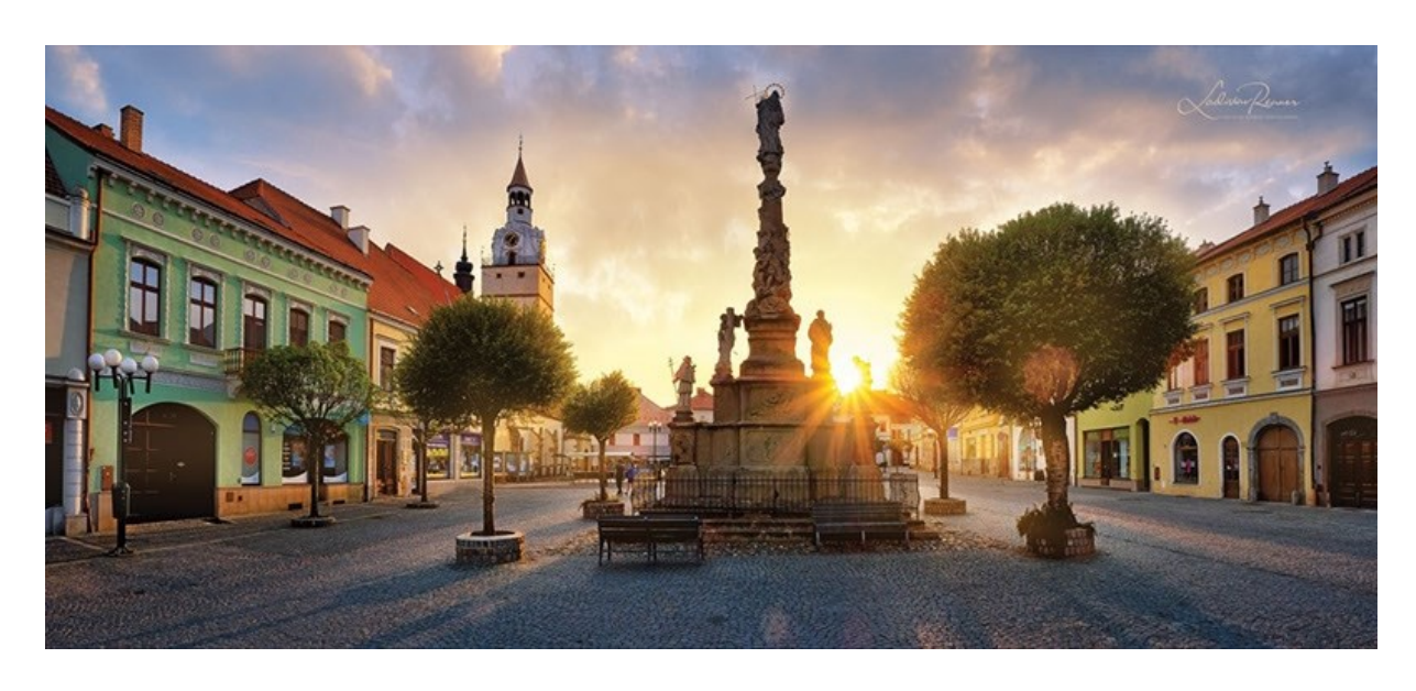
Ivančice + Moravský Krumlov