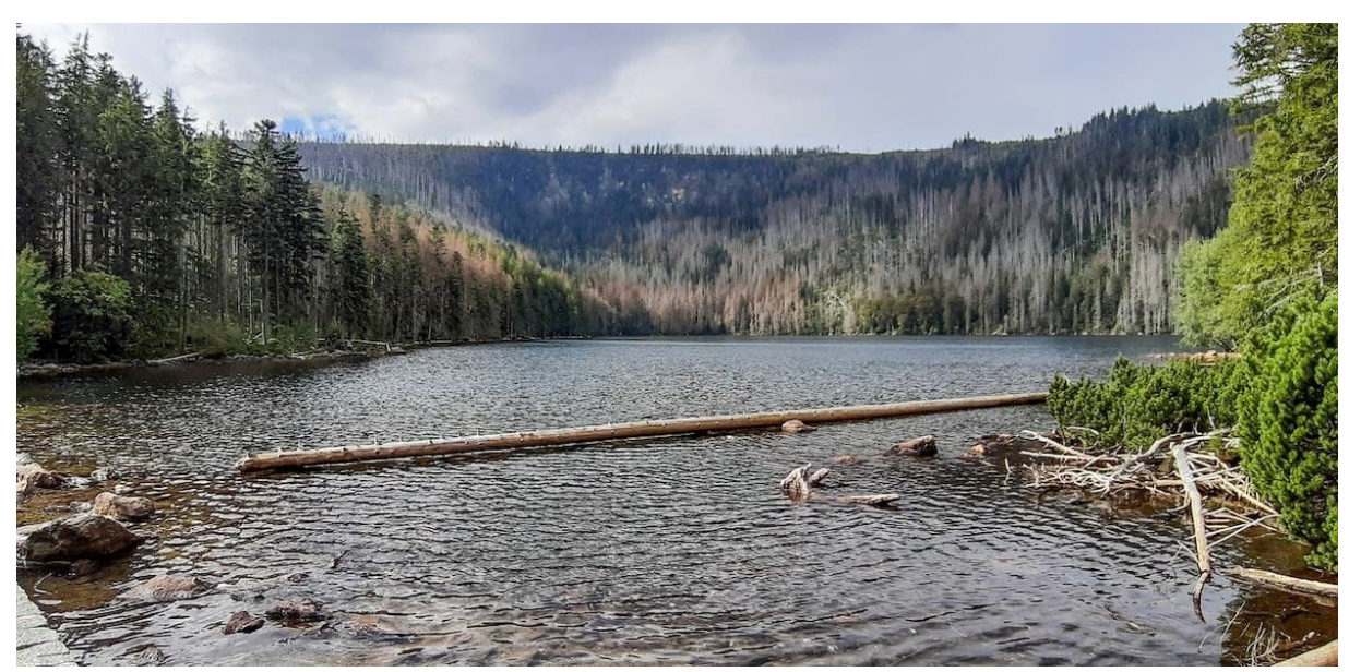
Devils lake (deepest in CZ)