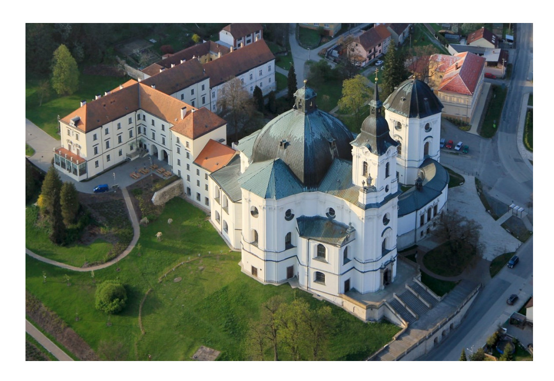
How to get there <a href="https://goo.gl/maps/nZvCbUj8DL5WPDCs8">https://goo.gl/maps/nZvCbUj8DL5WPDCs8</a>