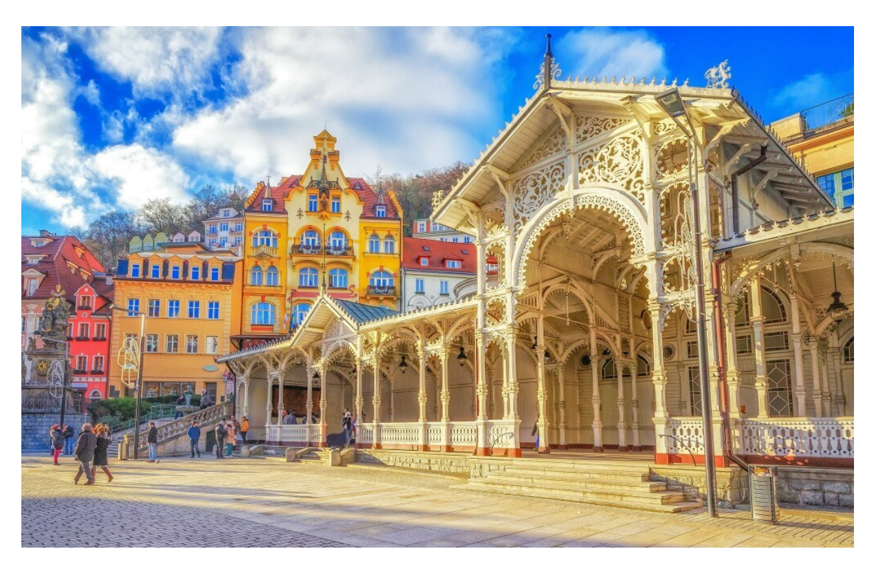
Famous Spa city, film festival takes place here, beautiful parks around the city.