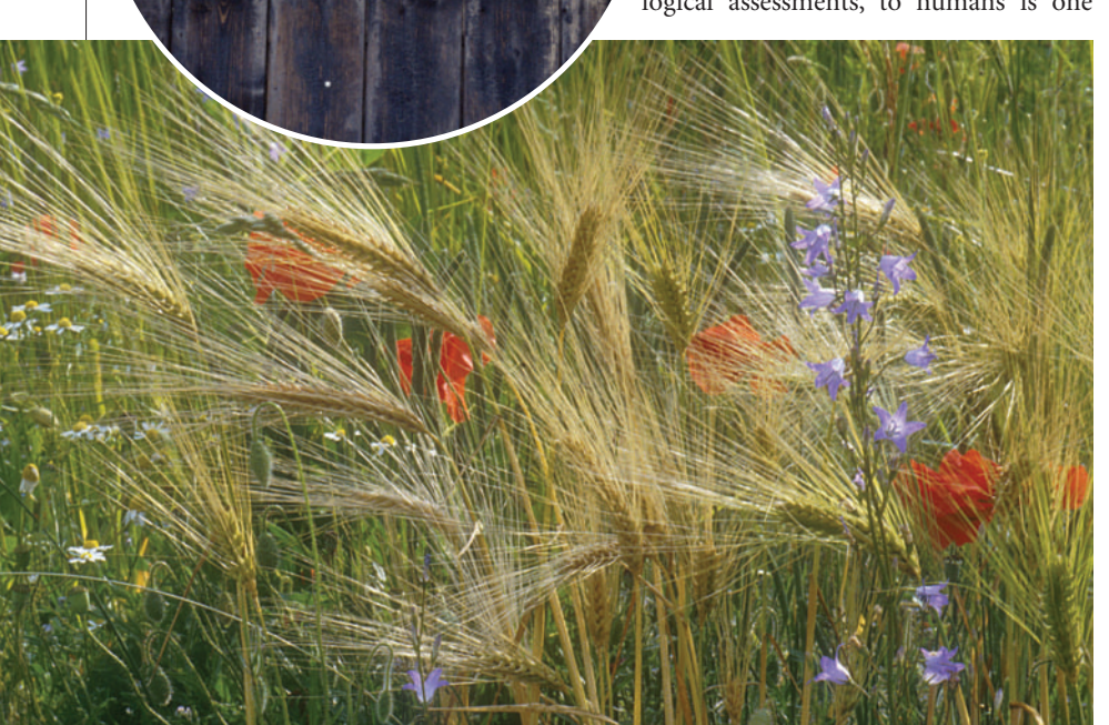
Where there's life: the broad biodiversity supported by this organic cereal crop is clear to see.

In theory, organic farms are friendlier to the atmosphere. They should, for instance, generate less carbon dioxide, which is released