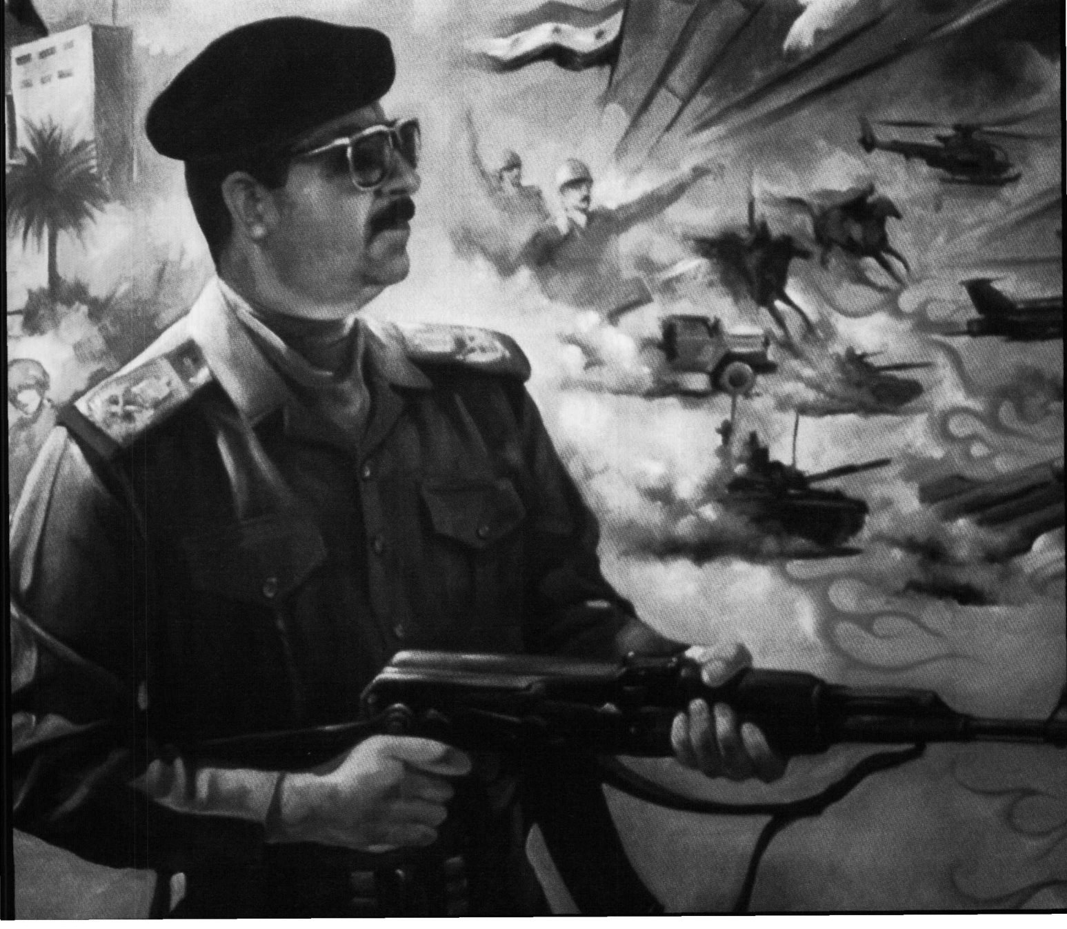
Reproduced with permission of the copyright owner. Further reproduction prohibited without permission.