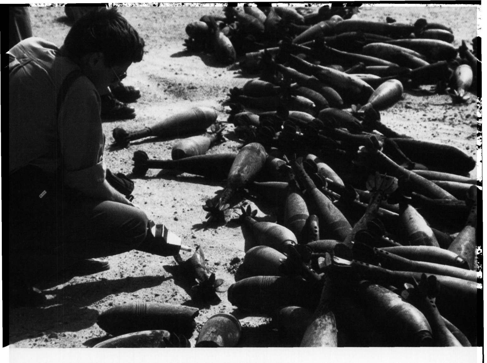
Shell game: An UNSCOM expert in Iraq checks tear gas-filled mortar shells for leakage in 1991.

tionally suicidal," then his survival instincts appear to be even more finely honed.