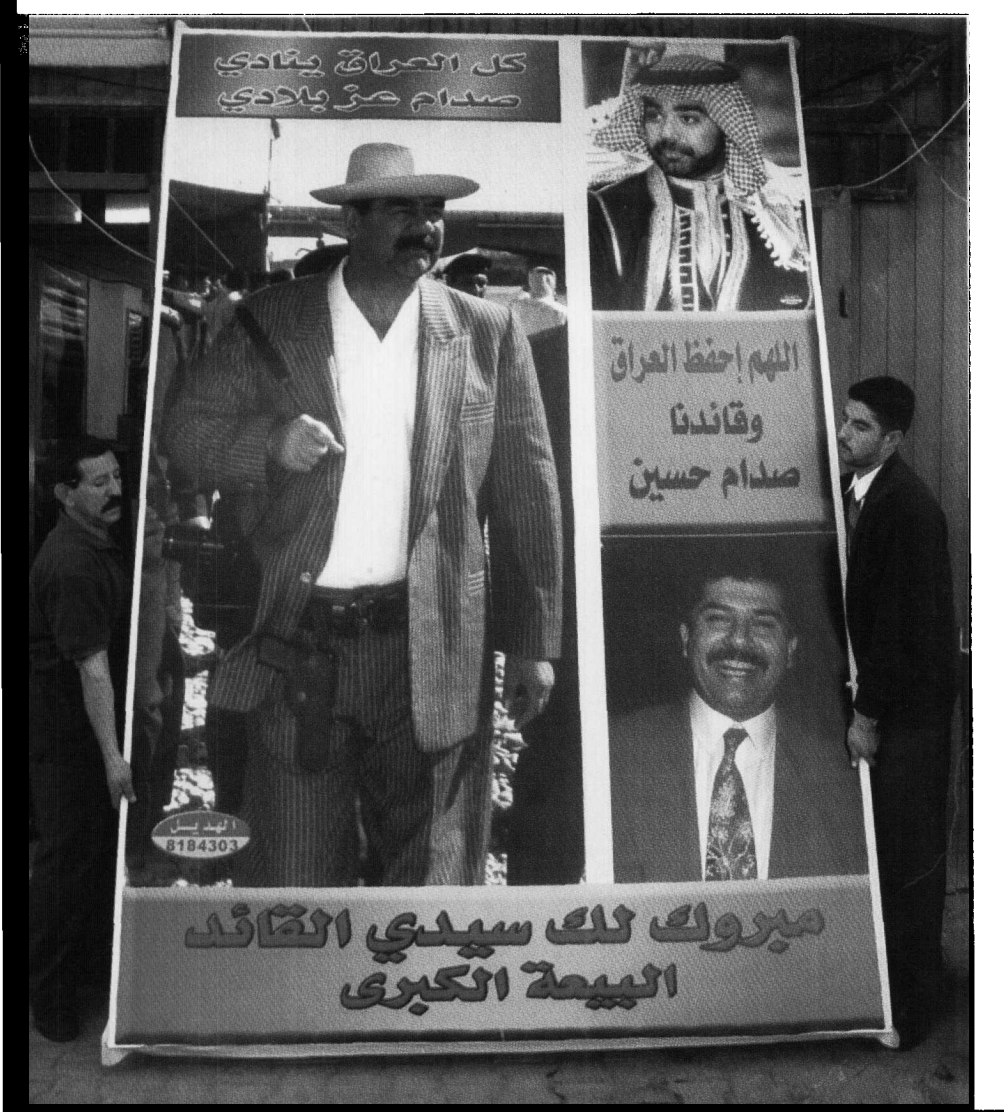
P WINF WORLD

Still crazy after all these years? A display of sartorial splendor by Saddam and sons graces Baghdad following Saddam's second presidential referendum, held in 2002.