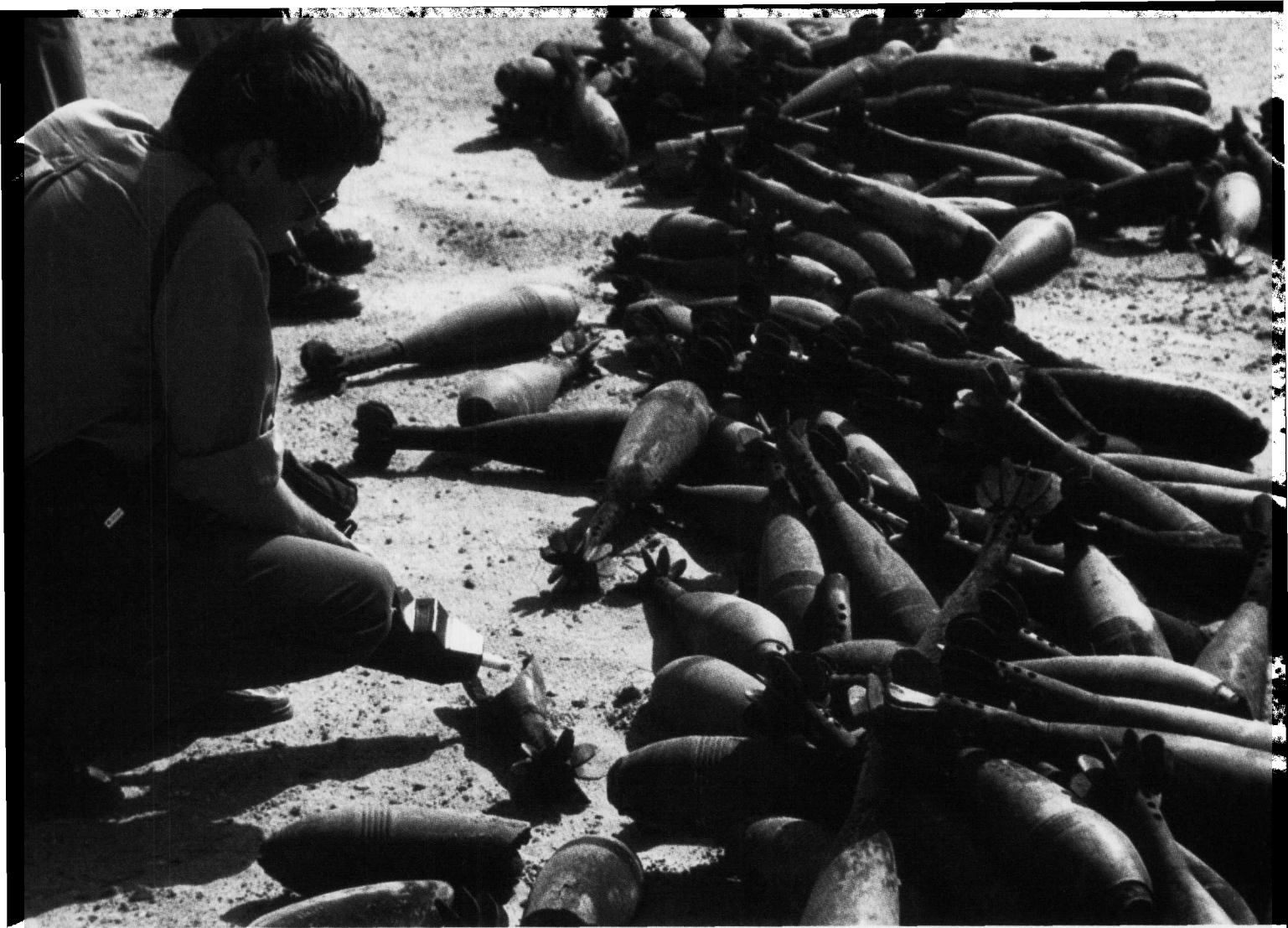
Shell game: An UNSCOM expert in Iraq checks tear gas-filled mortar shells for leakage in 1991.

tionally suicidal,” then his survival instincts appear to be even more finely honed.