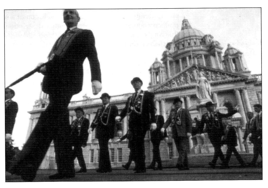
Figure 19.1 Members of the Orange Order, Northern Ireland, commemorate the defeat of the Irish at the Battle of the Boyne in 1690