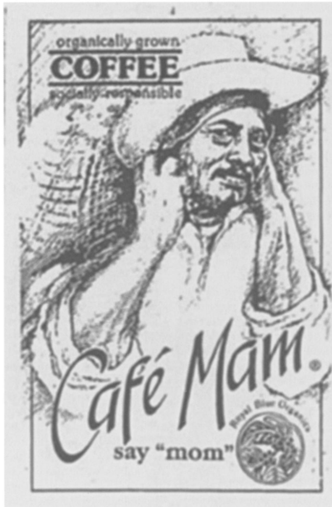
Figure 3 Image of Café Mam marketing brochure

strategies on the labels of fair trade products (Goodman 2004). Figure 3 provides an example of narratives surrounding fair trade coffee sold under the Café Mam® brand. Conjoined with this image is a description of the production and consumption setting: