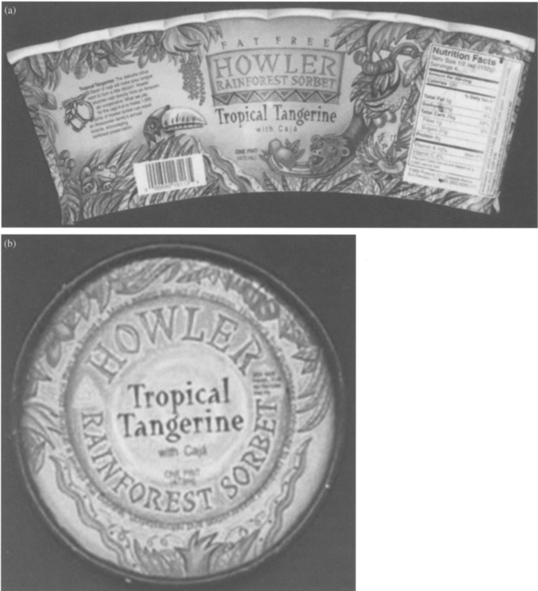
Figure 2 Images of Howler's 'Rainforest Sorbet'

reinforces the connections between goodness, consumption and conservation: