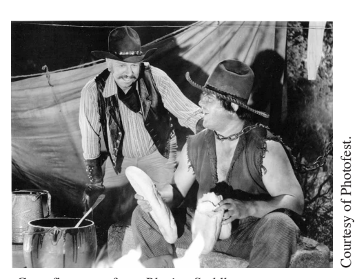
Campfire scene from Blazing Saddles.

the outcome of the film. Rex's character defeats the other good guy in the final shootout of Rustlers' Rhapsody . During the shootout it is revealed that the other good guy is, in reality, a bad guy, thus reinforcing the notion that the good guy always wins the shootout.