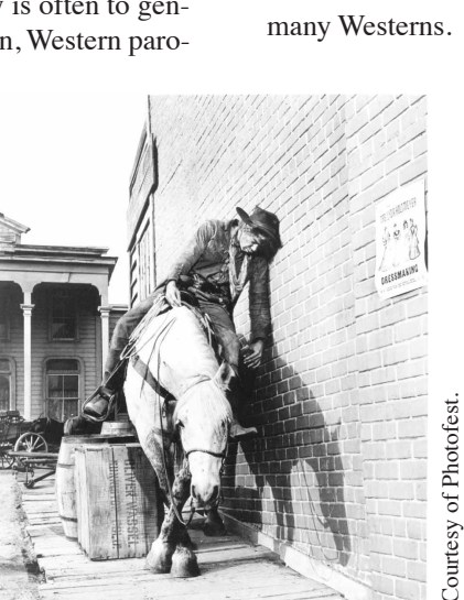
Kid Shelleen (Lee Marvin) from Cat Ballou.

dence that a more systematic parody of the genre is taking place. Fenin states that the film is "making short work of Western plot and dialogue clichés. Even the inevitable romantic interest was played for its cliché value" (254). Indeed, the film satirizes everything from saloons to shootouts in a very self-conscious style. The basic comic premise of the film lies in a common conflict in Westerns. It is a clash that occurred between Westerners and Easterners when the Easterners came west. Typically the Easterner will stick out because his attitudes and beliefs conflict with the reality of the West. In this case, the Easterners stick out even more because they are the Marx Brothers. The plot is fairly formulaic, centering on a young couple that the brothers help to protect from an unscrupulous saloon owner who wants to strike it