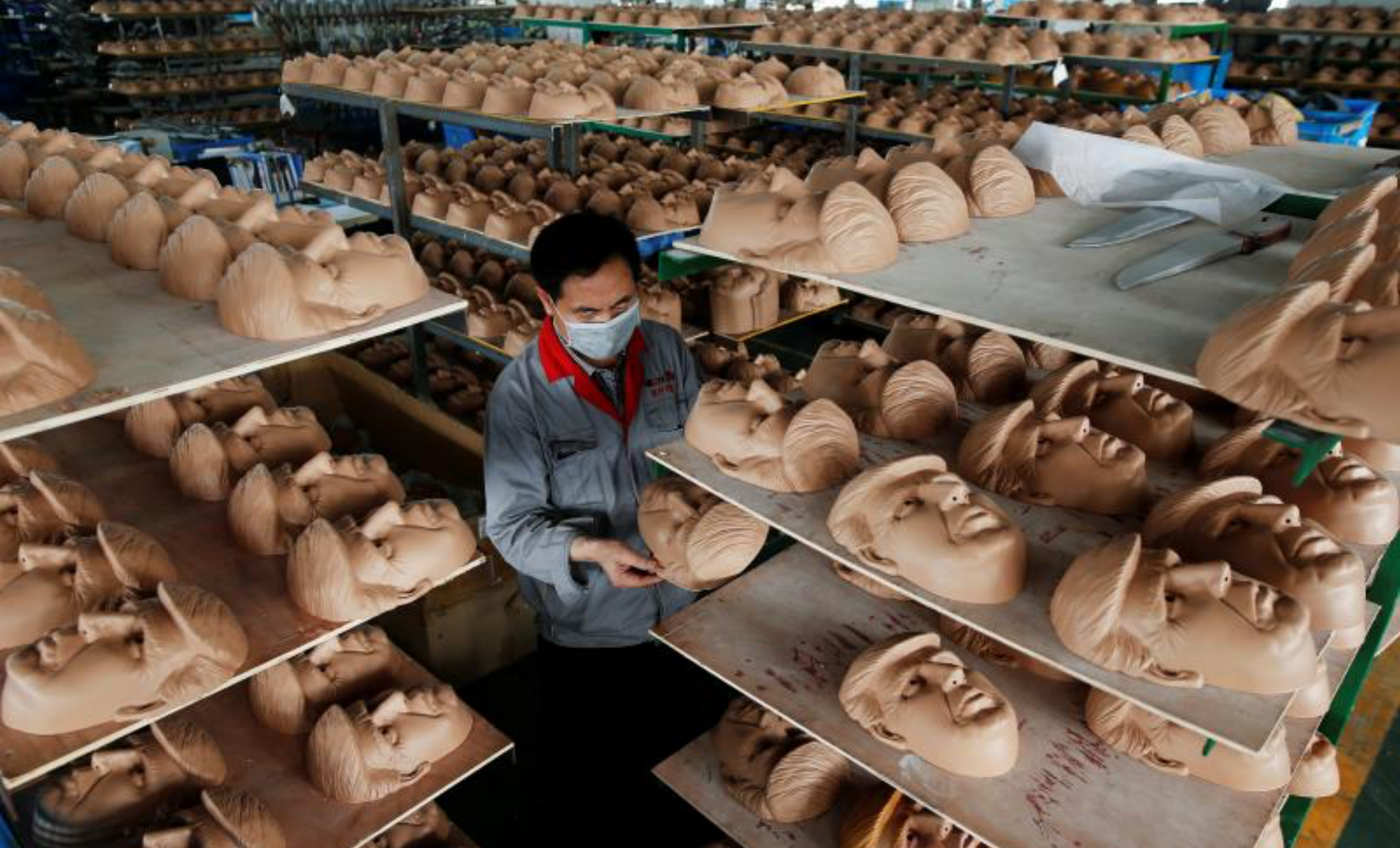
A worker inspects a mask of then-presidential candidate Donald Trump in Jinhua, China, May 2016.