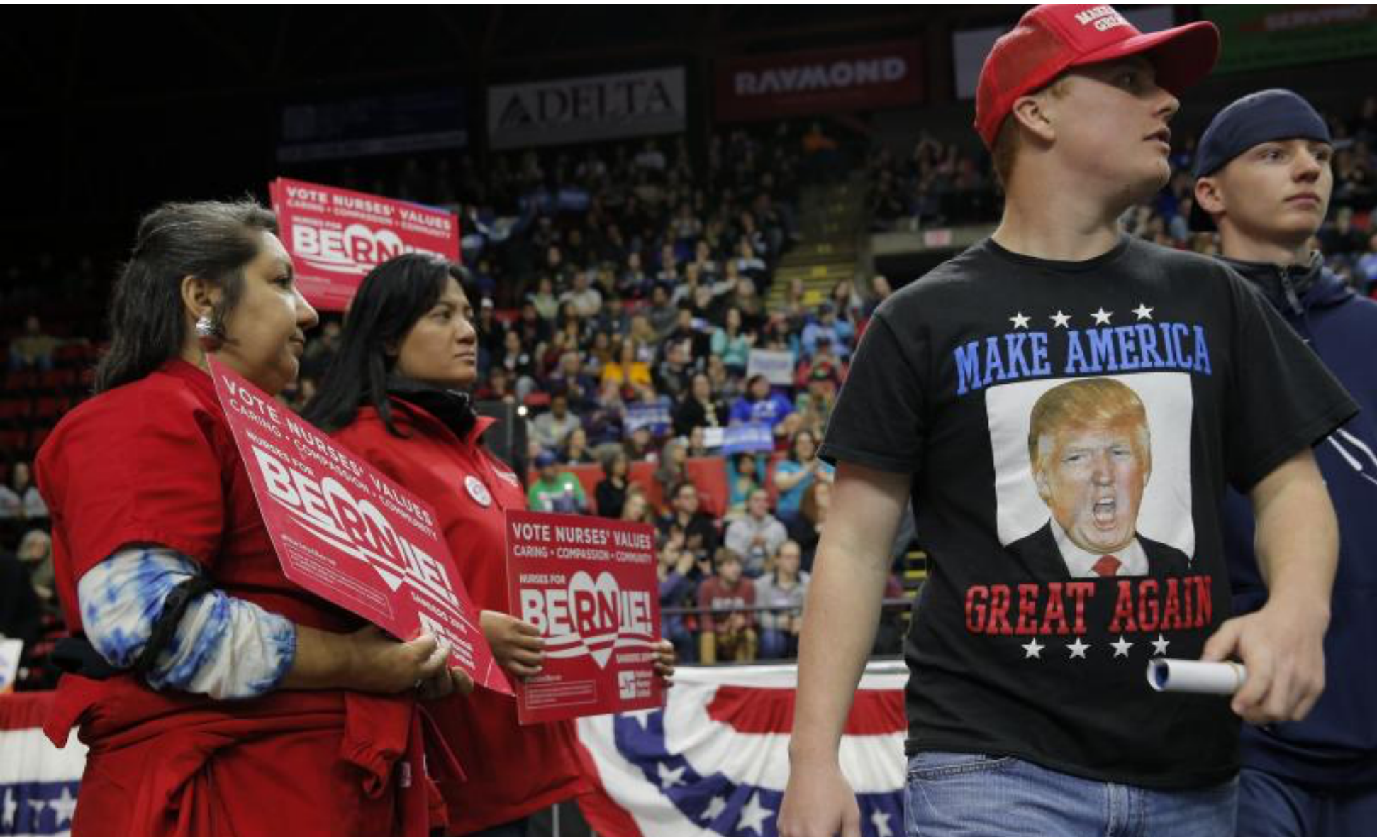
A Trump supporter leaves a rally for Democratic primary candidate Bernie Sanders in New York, April 2016.

Now the globalist elites have been overthrown at the very same ballot box that used to sustain their rule.