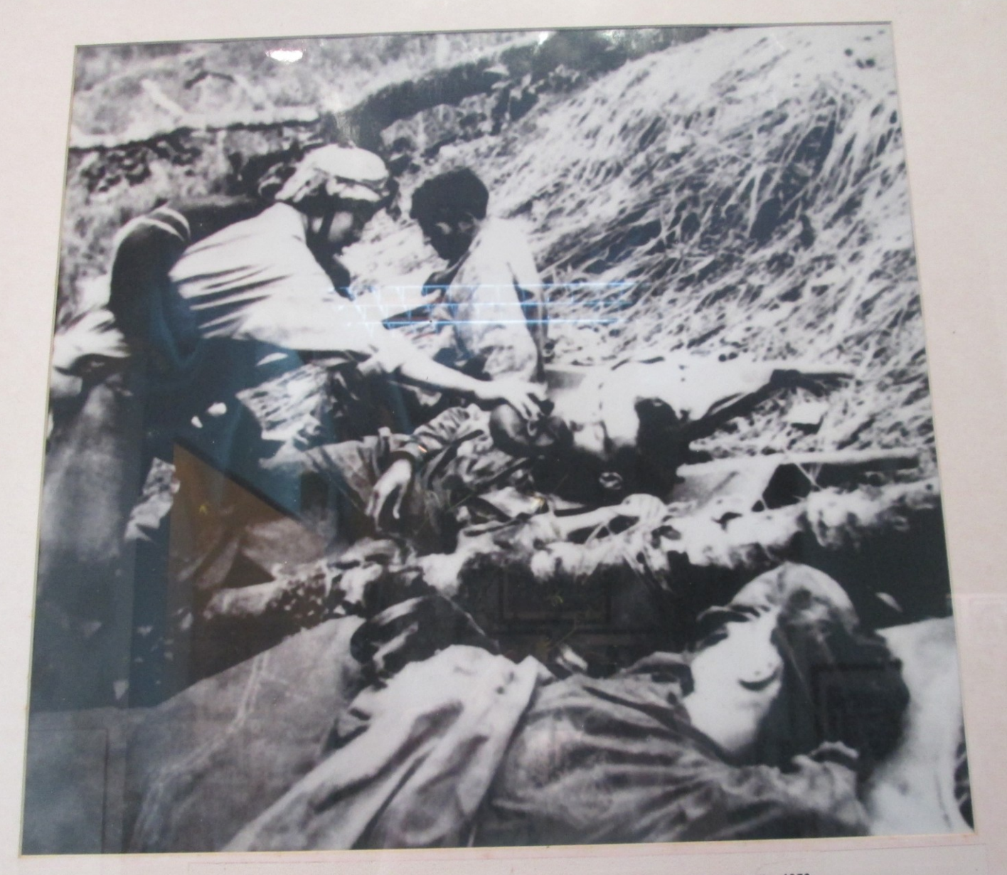
Hành động nhân đạo của bộ đội ta đối với tù binh bị thương trong chiến dịch Biên giới, năm 1950 An act of humanitarianism of Vietnam People's Army soldiers toward wounded enemy