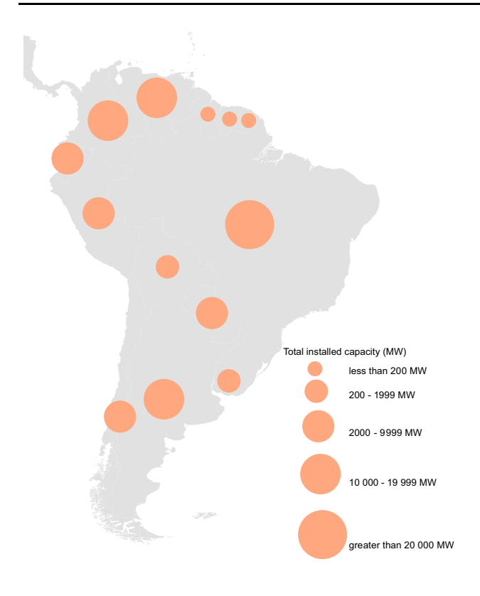
Fig. 1 Installed capacity in South America (including pumped storage). Source of data International Hydropower Association (2018)

international engagement through south-south cooperation mechanisms (Mora 2018). In China, public-private corporations blur the line between the private sector and state intervention. Therefore, this bilateral support for hydropower comes in the form of loans from national development banks such as China's Eximbank and engineering/construction support from public to private corporations and private construction firms. In the case of Ecuador, the administration of Rafael Correa secured loans from the Chinese government to develop eight new dams,