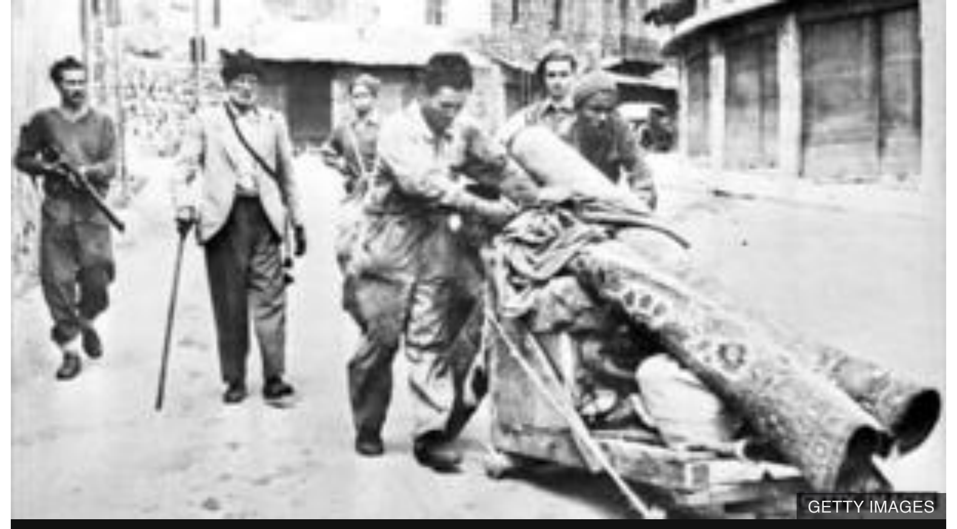
Thousands of Palestinians fled or were driven from their homes in the war that followed Israel's independence

1948-1949 - First Arab-Israeli war. Armistice agreements leave Israel with more territory than envisaged under the Partition Plan, including western Jerusalem. Jordan annexes West Bank and eastern Jerusalem, Egypt occupies Gaza.