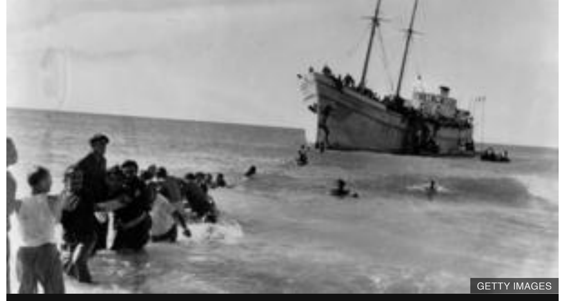
Jews fleeing persecution arrived by the shipload, often having to evade blockades

1939 - British government White Paper seeks to limit Jewish migration to Palestine to 10,000 per year, excepting emergencies.