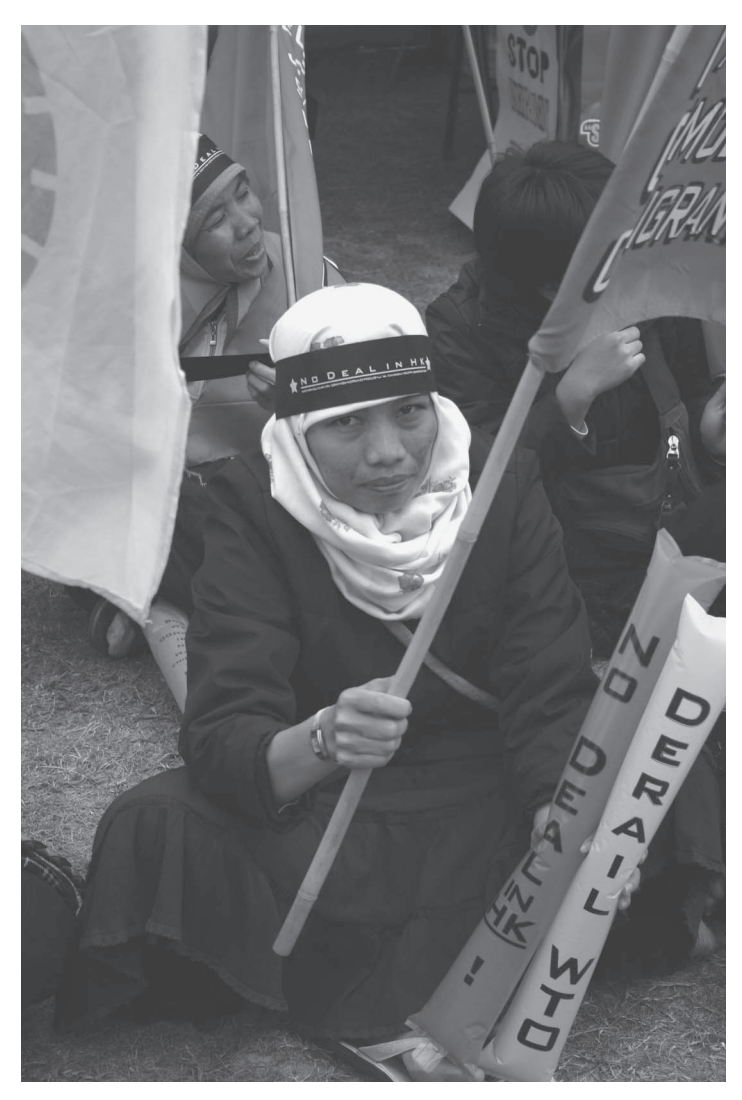
An Indonesian domestic worker waves anti-WTO balloons and a banner at Victoria Park, Causeway Bay, December 11, 2005.