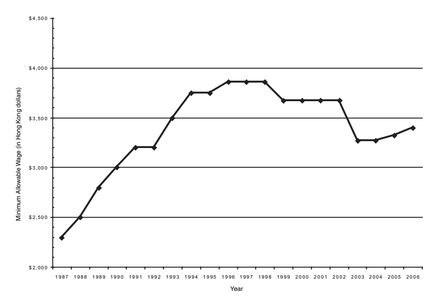
FIGURE 6.1. Minimum allowable wage for foreign domestic helpers in Hong Kong, 1987– 2006.

The employer has other financial obligations to the foreign domestic worker besides the basic wage. He or she is responsible for providing free passage to and from Hong Kong upon termination or expiration of the contract. The worker is also supposed to receive a minimum daily travel allowance from the place and date of origin until arrival in Hong Kong and on her return home, assuming the most direct trip. The employer is also responsible for reimbursing the domestic worker for all the costs of preparing her documents—including visas, medical examinations, "authentication fees" paid to the consulate, and other processing fees—but only if the worker shows receipts for these expenses. Most of the domestic workers I met at the mission had paid such fees themselves and had not been reimbursed by their employers. Some were too timid to ask for reimbursement; others could not claim reimbursement because they had not received receipts.