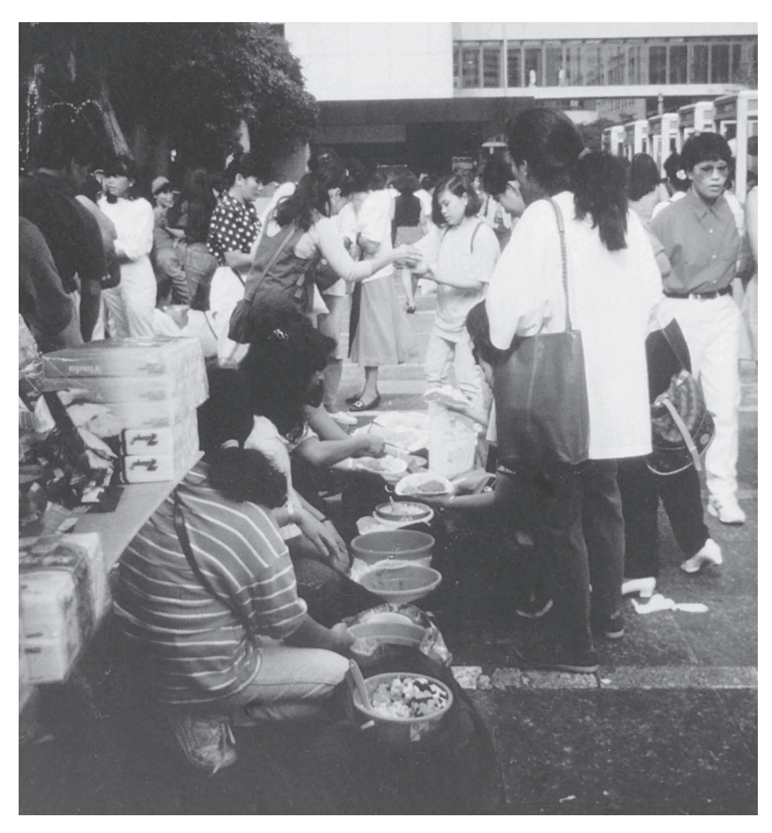
Hawkers openly sell food in the square on Sundays in 1993. By 2005 this was a rare sight.

Protestors in Chater Garden call for a wage increase and for abolition of the two-week rule, August 1993.