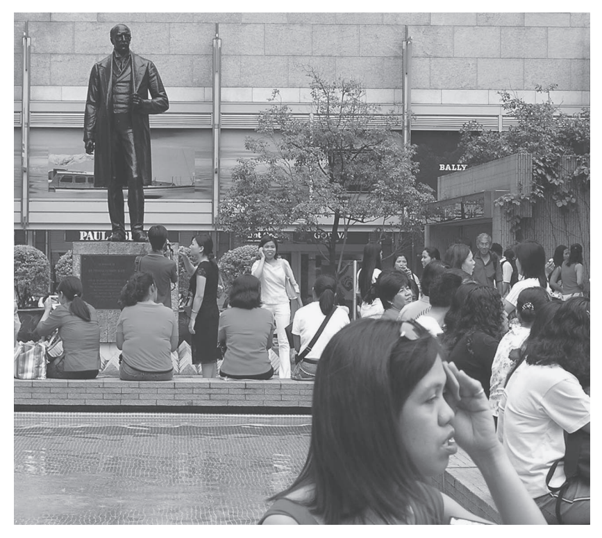
Filipina domestic workers congregate under the "black statue" in Statue Square on Sundays, summer 2005.

Crowds of Filipina domestic workers gather in under the shade of the Hong Kong Shanghai Bank in Central District on Sundays, June 2005.