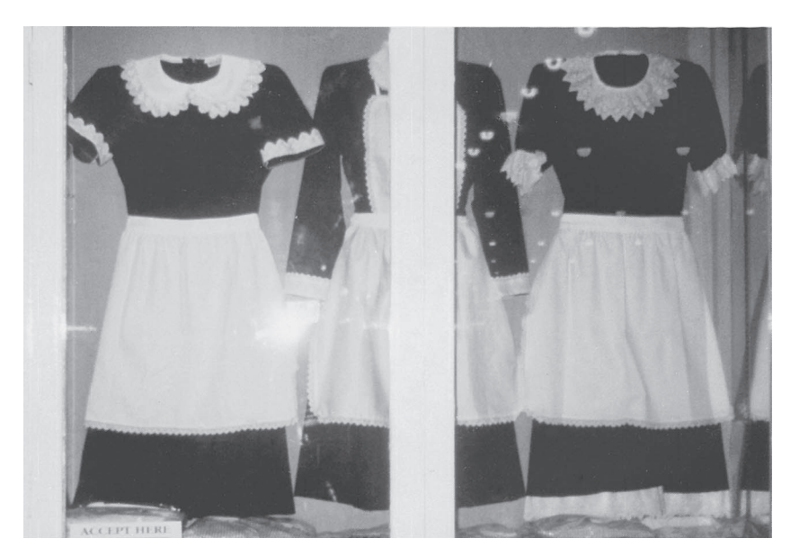
The window display of a shop in Worldwide Plaza that sells domestic worker uniforms, 1994.