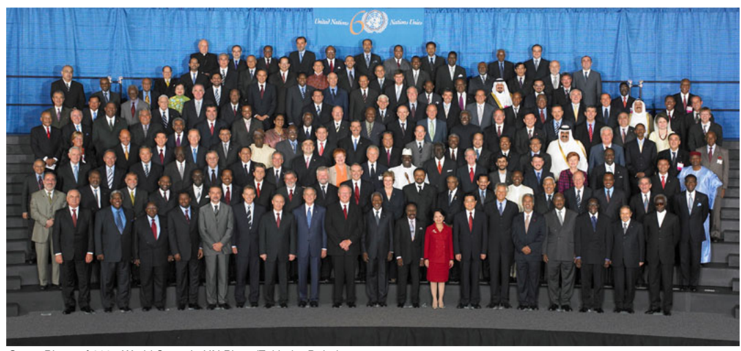
Group Photo of 2005 World Summit.

ny.un.org/doc/UNDOC/GEN/N05/487/60/pdf/N0548760.pdf?OpenElement)) Heads of State and Government affirmed their responsibility to protect their own populations from genocide, war crimes, ethnic cleansing and crimes against humanity and accepted a collective responsibility to encourage and help each other uphold this commitment. They also declared their preparedness to take timely and decisive action, in accordance with the United Nations Charter and in cooperation with relevant regional organizations, when national authorities manifestly fail to protect their populations.