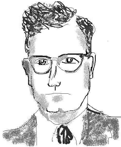
A sketch of sociologist C. Wright Mills.

Some view a sociological lens as disempowering, leading them to ask, “Doesn’t this mean that I am just another statistic? Doesn’t this reduce my most personal experiences to a routine and common occurrence?” However, seeing our experiences as part of a broader pattern enables us to connect with others who share similar (if ultimately unique) experiences. If there are common social explanations, then perhaps that can form the beginning of an ability to make social changes that will enable people to alleviate their problems.