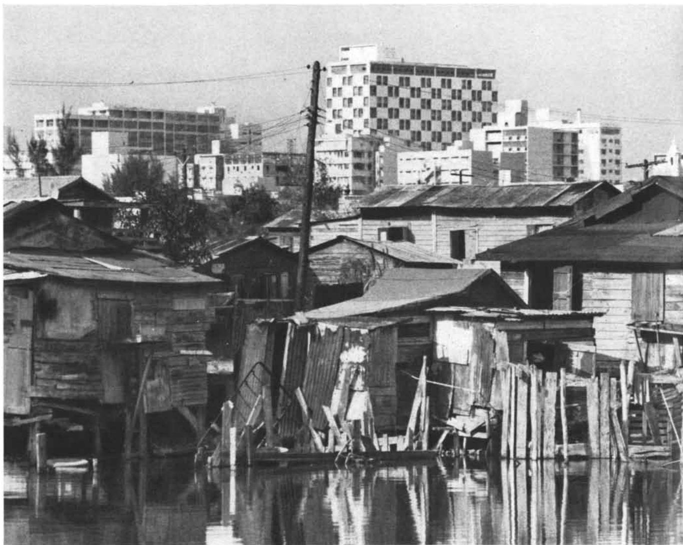
WATERFRONT SHACKS of a Puerto Rican slum provide a sharp contrast to the modern construction that characterizes the prosperous parts of San Juan's Santurce district ( rear ).

All this work serves to establish the context for close-range study of a selected few families. Because the family is a small social system, it lends itself to