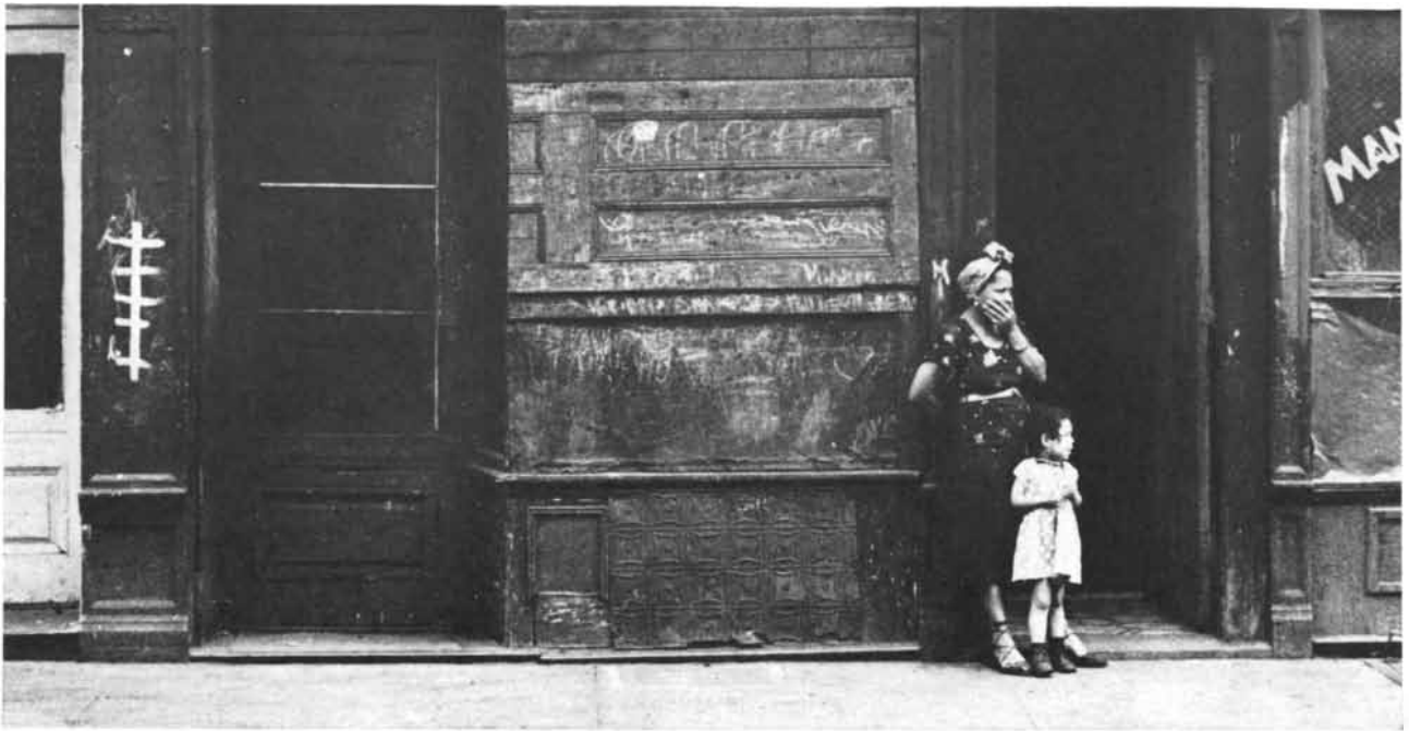
MOTHER AND DAUGHTER stand together by the door of a run-down apartment building on upper Park Avenue. Because common-law marriage offers the female participant in the culture of poverty

more protection of her property rights and surer custody of her children than formal marriage does, the mother is usually the head of the household and family ties are to her kin and not the father's.