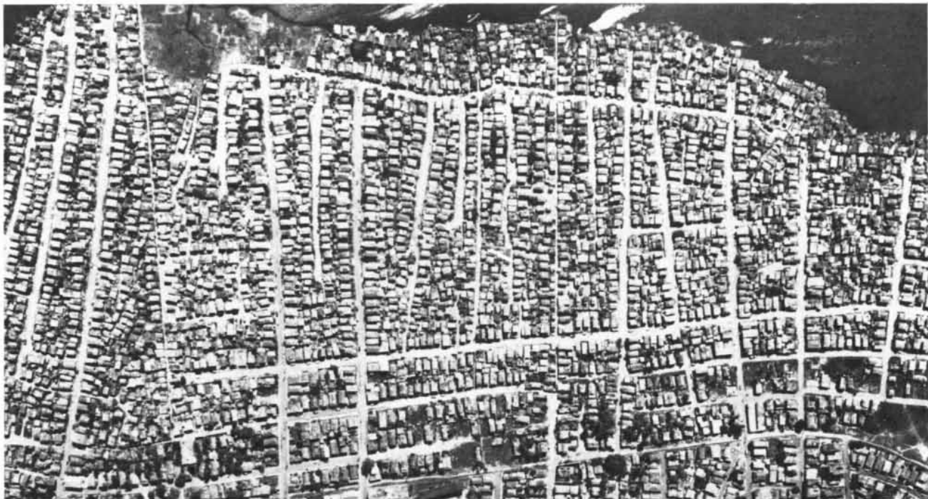
SAN JUAN SLUM AREA in the Santurce district sprawls along the edge of the tidal inlet ( top ) that connects the city's harbor with San José Lake. Ricketty buildings have been erected on stilts be-

yond the high-water line and narrow alleyways crisscross the district. Compared to this area, many of New York's worst slum areas, such as the ones that appear below, are nearly middle-class.