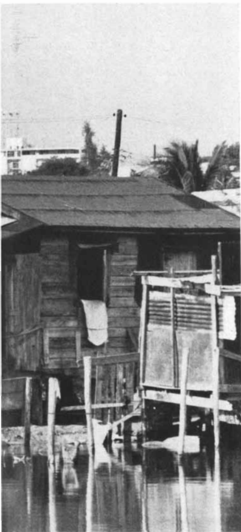
uncommon among participants in the culture of poverty; although gregarious, they seldom manage to become well organized.

People in a culture of poverty produce little wealth and receive little in return. Chronic unemployment and underemployment, low wages, lack of property, lack of savings, absence of food reserves in the home and chronic shortage of cash imprison the family and the individual in a vicious circle. Thus for lack of cash the slum householder makes frequent purchases of