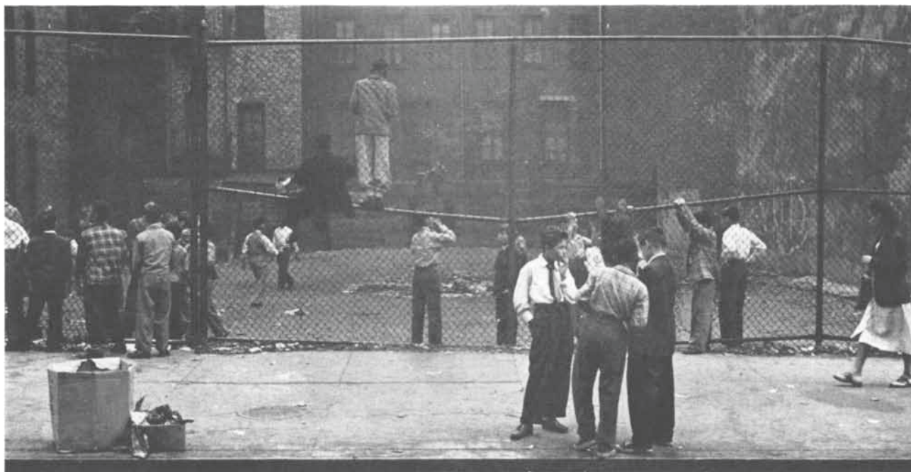
PUERTO RICAN BOYS in a Manhattan upper East Side neighborhood use the fenced-off yard of a deserted school as an impromptu playground. The culture of poverty does not cherish

childhood as a protected and especially prolonged part of the life cycle. Sexual maturity is early, the male is accepted as a superior and men are strongly preoccupied with machismo , or masculinity.