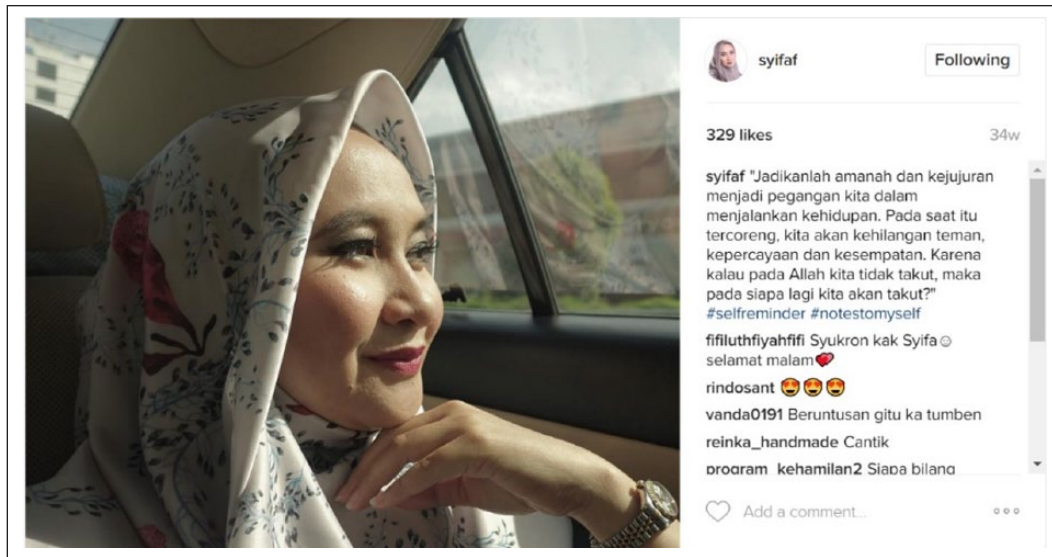
Figure 1. @syifaf. Screenshot, July 2017.