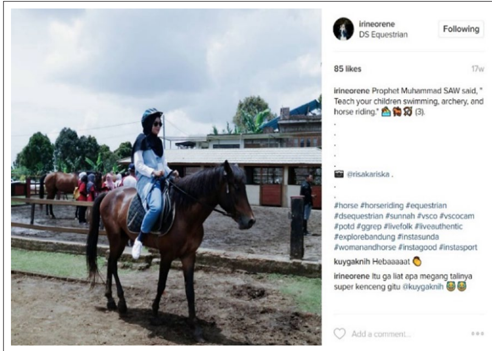
Figure 3. @irineorene. Screenshot, January 2017.