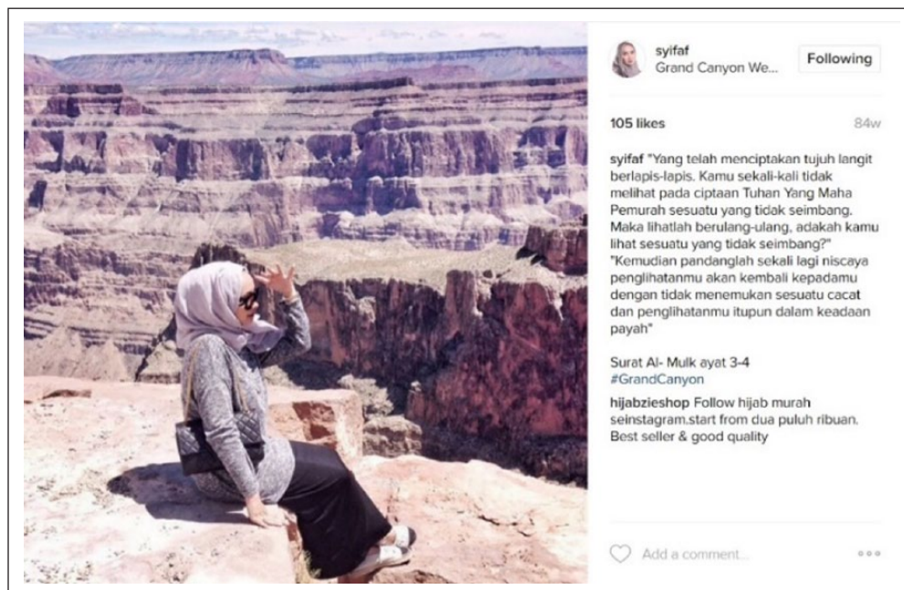
Figure 2. @syifaf. Screenshot, July 2017.

shows her modestly dressed body engulfed by the well-recognizable rugged landscape of the Grand Canyon. This reframing directs the viewers gaze away from her beautifully veiled face, and toward her emplacement in iconic exotic settings. This image shows how depth of field is being used to evince a sense of the hijaber as empowered for her mobility. What is being performed here is an agentive, active mode of Muslimah publicness: not a publicness limited to inviting a gaze, but one that gazes back, if not into the camera, then at the 'other'; the dry, rough-hewn American landscape (Figure 2).