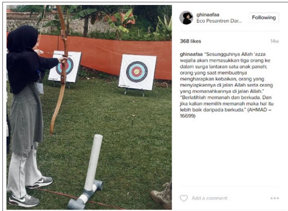
Figure 4. @ghinaafaa. Screenshot, January 2017.

When hijabers appear side by side their husbands, it is in posts that posit the ideal marriage as one in which husband and wife enjoy equal status. In the posts below, Udhe and