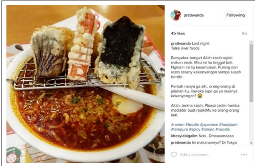
Figure 7. @pratiwanda. Screenshot, July 2017.

thing is that both put in equal effort to keep the relationship happy and romantic until old age, noting the importance of keeping the harmony and intimacy between husband and wife.