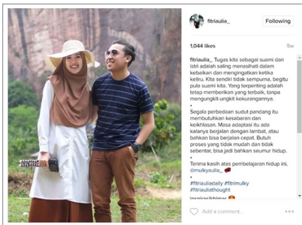
Figure 6. @fitriaulia. Screenshot, April 2017.

husband gaze into eachothers' eyes, suggesting reciprocity (Figure 5 & 6). Udhe captions her post thus: