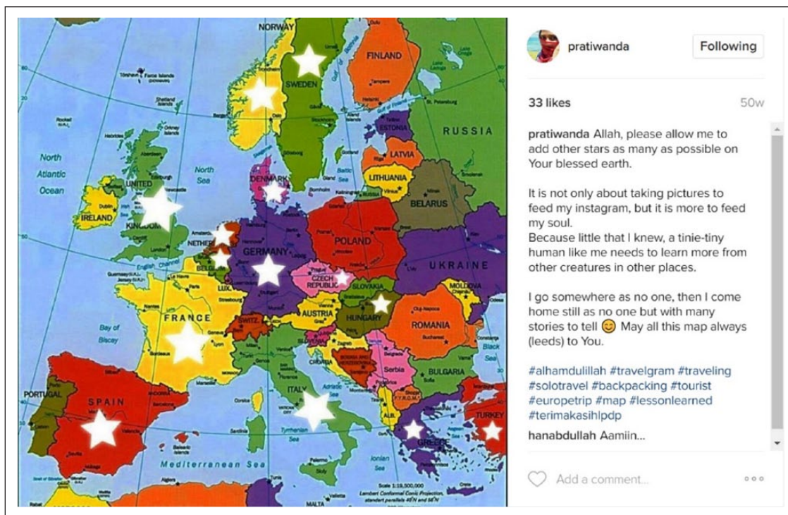
Figure 10. @pratiwanda. Screengrabbed, July 2017.

empowerment—problematic from a feminist perspective because it limits such empowerment to women’s capacity to consume. At the same time, by presenting themselves first and foremost as objects of consumer desire, the hijabers gain an opportunity to “slide under the radar” (Abidin, 2016, p. 2). Framing their relationships with their husbands as a feature of a middle-class consumer culture, they capitalize on Instagram’s valorisation of the consuming woman to present controversial female subjectivities (for example, the Muslimah wife who stands on an equal footing with her husband) in a palatable format. In this way, they shape Muslimah pop culture consumers’ aspirations in a way synchronous with an Indonesian feminist agenda to reform the institution of marriage.