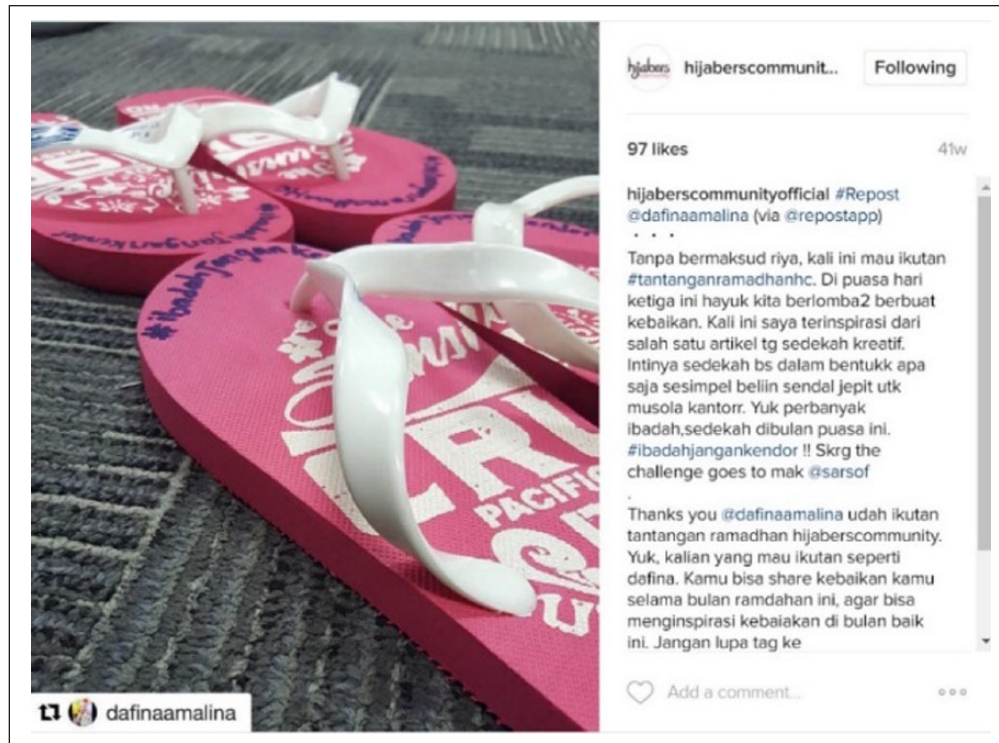
Figure 8 @hijaberscommunity. Screenshot, July 2017.

This turned my mind to people who live on the street—do they forget what it feels like to have a full stomach? Thankyou Allah, please allow me to pass on your blessings to others.