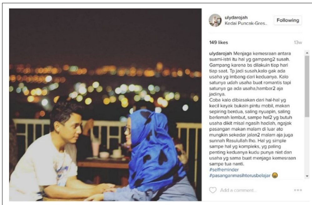
Figure 5. @ulydarojah. Screenshot, April 2017.