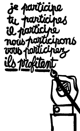
FIGURE 1 French Student Poster. In English, I participate; you participate; he participates; we participate; you participate . . . They profit.

There is a critical difference between going through the empty ritual of participation and having the real power needed to affect the outcome of the process. This difference is brilliantly capsulized in a poster painted last spring by the French students to explain the student-worker rebellion. 2 (See Figure 1.) The poster highlights the fundamental point that participation without redistribution of power is an empty and frustrating process for the powerless. It allows the power-holders to claim that all sides were considered, but makes it possible for only some of those sides to benefit. It maintains the status quo. Essentially, it is what has